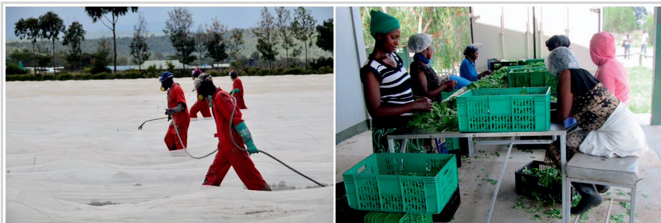
FIGURE 3 Horticultural farm in Nanyuki, Kenya. Left: application of pesticides; right: grading of bok choy.

The produce—runner beans, garden peas, snow peas, green and yellow fine beans, bok choy, basil, chives, green onions, and others—is grown exclusively for export and graded according to a strict process in line with international standards such as GlobalG.A.P., Tesco Nature's Choice, and Marks & Spencer Field to Fork. Produce that fails to meet the grading standards is rejected and disposed of at the horticulture farms or returned to the outgrowers. Vegetables and herbs that are highly perishable are transported in a cold chain and within the shortest possible time after harvest and packing to maintain quality and extend shelf life in the destination markets. Insulated refrigerated trucks are used to transport the products from the farm gate in Laikipia or Meru County to the capital, Nairobi, for holding and forwarding by airfreight to Europe.