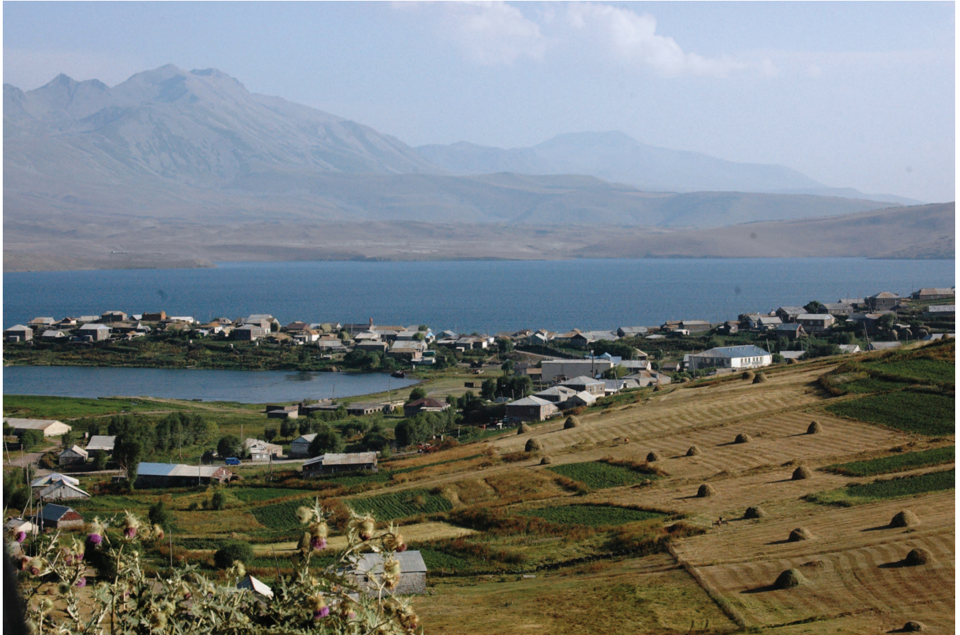
FIGURE 1 Georgia's beautiful mountain scenes offer great potential for community-based tourism: Tabatskuri village in the South Caucasus.