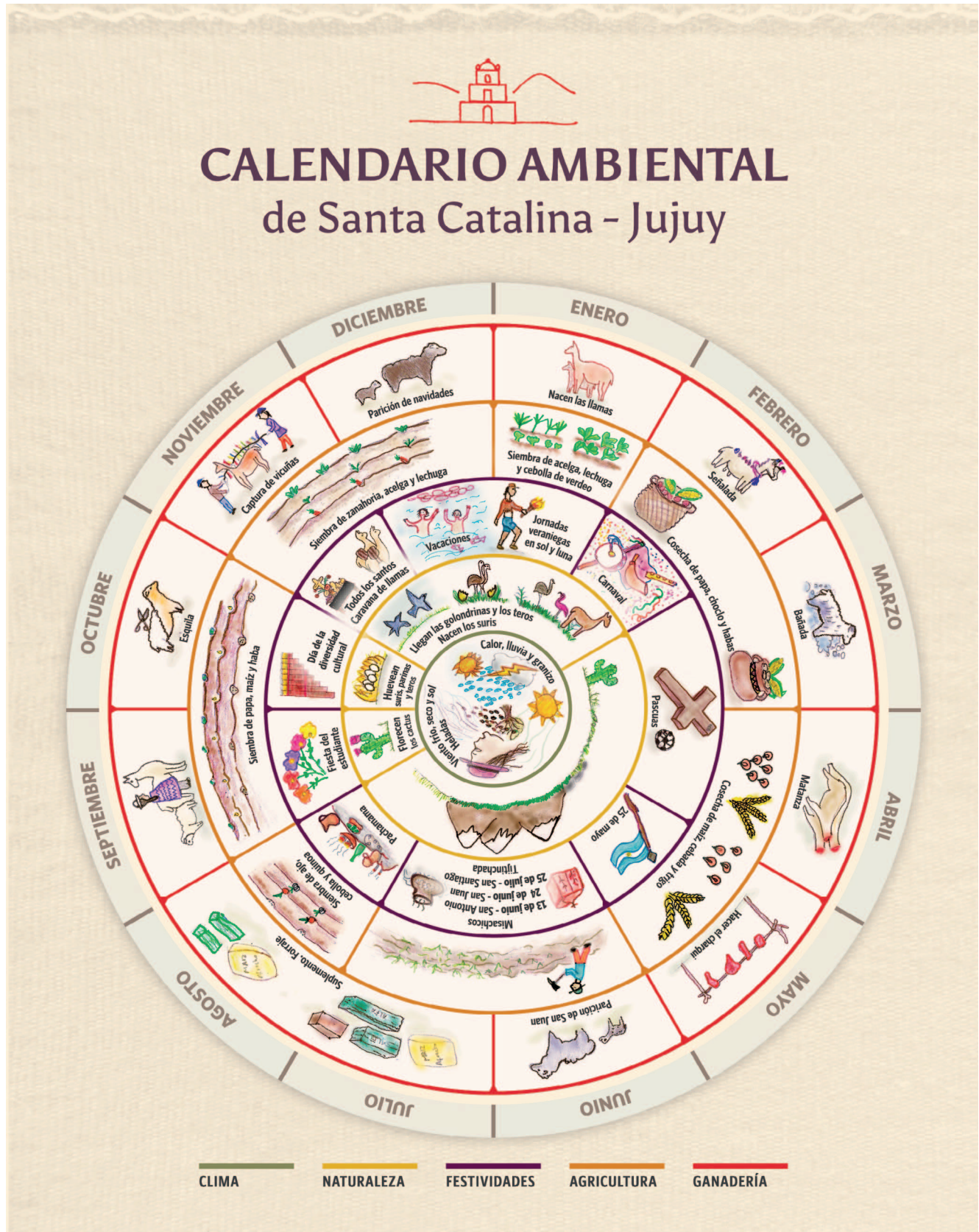
FIGURE 5 Participatory calendar produced at Vicuñas, Camélidos y Ambiente's environmental calendar workshop in April 2016. The calendar classifies activities and events into 5 categories, 1 in each ring. These rings are (from the center) climate, nature, local festivities, agronomic activities, and livestock management. Each slice represents a month of the year, from January (enero) to December (diciembre).