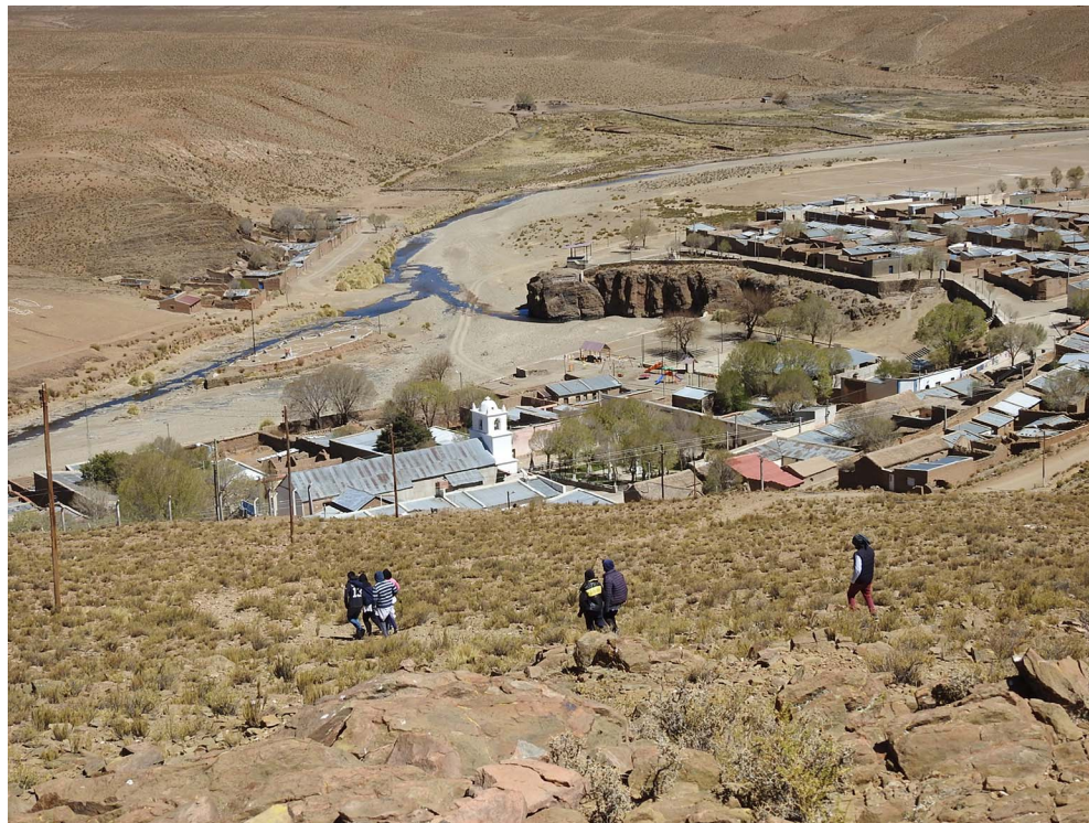
FIGURE 2 Santa Catalina school children coming back from the mountain to the town.

activity. We also proposed the creation of some form of lasting record, a material reminder of this shared experience, to which end participants were invited to engage in creative writing and drawing activities. All the exchanges and the children's productions were in Spanish.