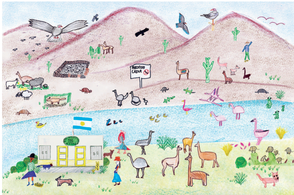
FIGURE 4 Biodiversity collage made by children of 3 schools from the Laguna de los Pozuelos MAB Biosphere Reserve in Jujuy, northwest Argentina.

when volcanoes are “on” ( prendidos in Spanish). Two other activities were proposed, drawing the landscape (Figure 3B) and writing poetry, with amazing results (the Spanish originals and further examples are provided in Appendix S1, Supplemental material , https://doi.org/10.1659/MRD-JOURNAL-D-20-00009.1.S1 ):