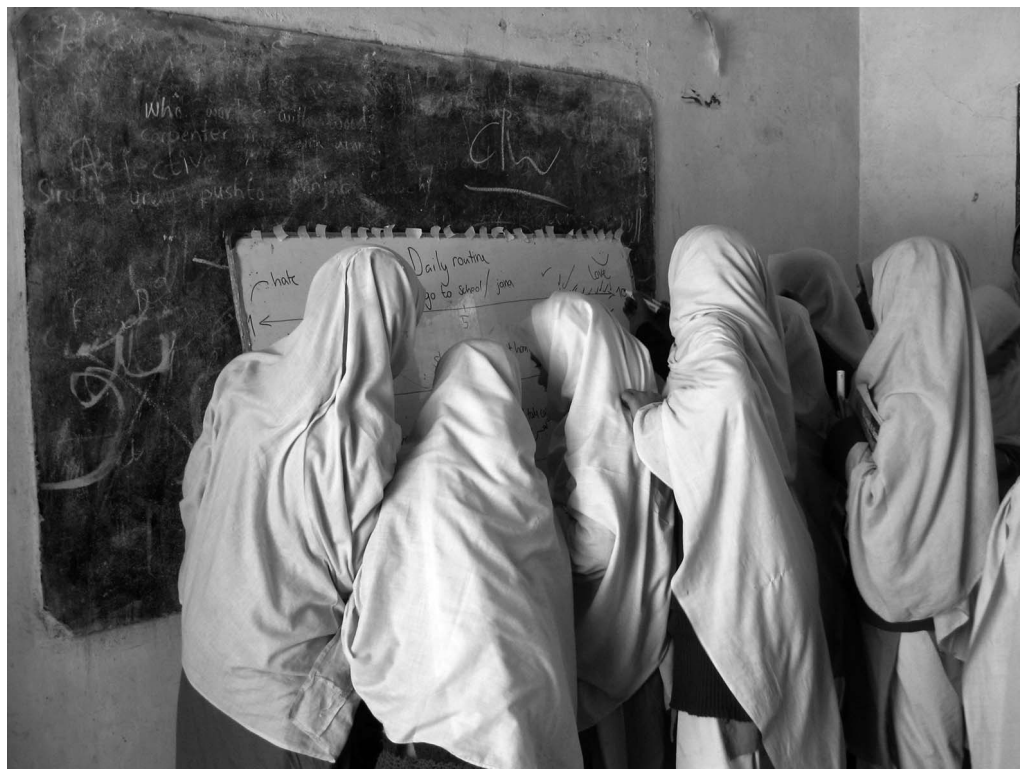
FIGURE 2 Workshop with students at a girls' school in Minapin, Nagar District, 7 April 2015.

workshops with (mainly female) teenage students (see Figure 2) and participatory observations during community meetings, invitations to households, and discussions in schools. These observations could not always be noted down directly but were protocolled afterwards. The majority of interviews were conducted with the help of female research assistants (local teachers), who facilitated access to interview partners and interpreted between the local languages, Burushaski and Shina, and English. In around half of the interviews ( Supplemental material , Appendix S1: https://doi.org/10.1659/MRD-JOURNAL-D-20-00028.1.S1 ), the main language was English and the first author communicated directly with the interview partners. During the interviews, notes were taken and, with the consent of the interview partners, some interviews were recorded and transcribed later. After each session, a short review of the interview notes was carried out with the research assistant to check for gaps and misunderstandings. One interview with a male informant was conducted jointly with the second author. As a female and foreign researcher, the first author did not experience cultural restrictions on conducting interviews with women and men. On most occasions, an open and trustful atmosphere could be created during the interviews, which was also because the research assistants were known to the interview partners and belonged to the same community.