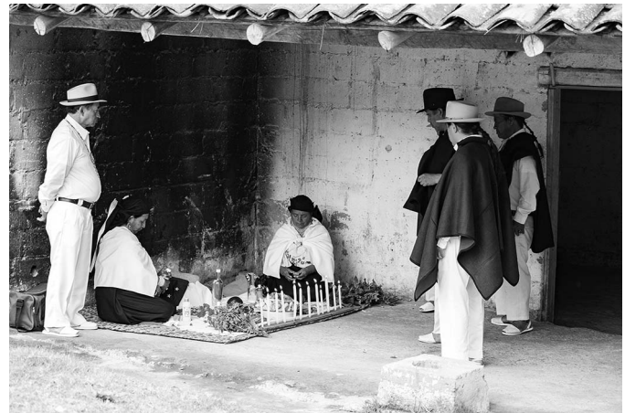
FIGURE 4 Oral traditions and storytelling are good ways to aid regenerative development by maintaining biocultural diversity and traditional practices of healing and other rituals associated with mountain livelihoods in the Otavalo valley, Ecuador.

transdisciplinary ontology of mountain theories to ease the transition to regenerative development thinking. These include the following: