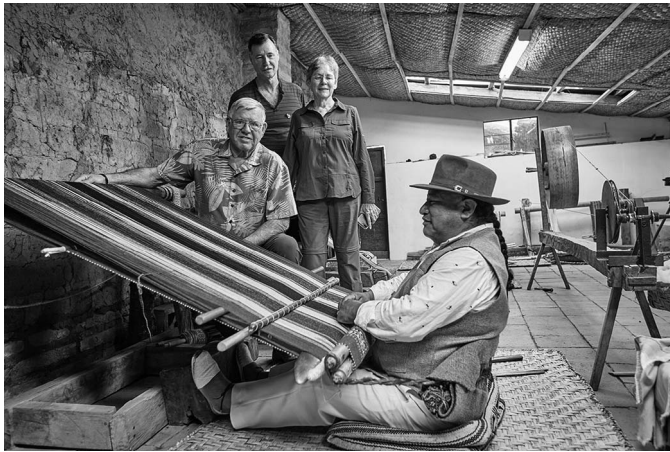
FIGURE 2 Extracurricular activity for lifelong learning of visitors exploring the artisan craft of an Otavaleño's textile-making workshop and ecomuseum, in Peguche, Imbabura province, Ecuador. Sharing stories and life experiences linked to the mountainscape and its mythologies that regenerate local knowledge is a strong motivation of ethnotourism in the Andes.

“Corporate Conscience,” each of which rely on traditional mountain geography. These lead to the implementation of the new pedagogical approaches presented below. The imperative of reducing barriers to environmental cognition is more crucial than ever (Ham et al 2010) with the internationalization of global education (Bishop 2009). We argue for broad application of the cross-cutting approach of montology (Sarmiento et al 2019) on behalf of a transdisciplinary wave that will educate the future citizens and denizens of mountain areas, maintaining ancestral and traditional ways of learning (Ball 2004; Ellis 2004; Wyndham 2010; Barreau et al 2019). We need to learn from failed attempts to achieve sustainability and integrate practical approaches of regenerative development. This will help to bridge the divides between the Global North and the Global South, between highland and the lowland ecoregions, between the education opportunities offered in schools versus home schooling, and between reductionist higher education and the holistic multiversities and practitioners of “real world” experience. We envision a montological framework that integrates different aspects of formal state education and private institutions, starting with young children and continuing to adulthood, in the so-called lifelong learning approaches to mountain cognition (Figure 2).