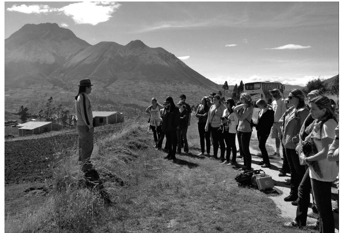
FIGURE 3 Field trips, study abroad, and other learning opportunities for outdoor education should be included in the montology educator toolbox, so that the content is linked with direct experience, such as with the group of students visiting the Imbakucha sacred landscape, now Imbabura Geopark, in Ecuador.

K-12 levels (primary and secondary education), as well as field trips, guided visits, and other cocurricular and extracurricular activities (Figure 3). Some programs have gained prestige and popularity among professionals. These include the United Nations Food and Agriculture Organization's International Programme on Research and Training on Sustainable Management of Mountain Areas with its 2-week course on mountain management in Italy, as well as special training offered by the International Centre for Integrated Mountain Development in Nepal and the Consortium for Sustainable Development of the Andean Ecoregion in Peru. Many universities offer mountain-themed programs, such as Colorado State University in the United States, the University of Central Asia in Kyrgyzstan, and the University of Innsbruck in Austria. Programs are also being tested in unorthodox systems of higher education (Ji 2011) and practiced in institutions such as the Franciscan Multiversity in Uruguay, the Latin American Multiversity of Higher Studies in Mexico, the Indigenous Multiversity for Traditional Knowledge in highland Peru, and the Technical “Multiversity” of Twente in the Netherlands. An agenda-making plan is dependent on situated knowledge, institutional support, and political will; however, these trends should be incorporated if montological approaches are to be followed.