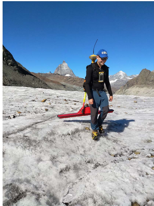
FIGURE 3 GPR measurements on the Gorner Glacier, near Zermatt, Switzerland, on 25 September 2018 (Box 2). The renowned Matterhorn (4478 m above sea level) appears in the background. Data from these measurements were analyzed under the frame of a seed funding project of CIRM.

(deep) integration of heterogeneous scientific and nonscientific points of view into collaborative research that contributes to the sustainability of mountains. Facilitation and other methodological approaches (eg common research site, codesign) were found to be very valuable, but our results also revealed that such integration was perceived to be related to a multidimensional transformation. While a clear gap identified in the literature is how inter- and transdisciplinary research can support societal transformations in mountains (Huber et al 2013; Martín-López et al 2019; Schneider, Giger, et al 2019), our experience adds that the operationalization of this research requires a transformation of the researchers. This finding resonates with Schneider, Giger, et al (2019), who reported that one of the mechanisms by which transdisciplinarity may generate social impact is the acquisition of embodied competences and knowledge in collective processes of self-transformation. This suggests that research centers should not only provide training on integrative methods (ie across the natural and social sciences) and facilitation techniques, but also on self-transformative procedures. Different techniques, like cognitive training or meditation, have been tested in organizational learning and management studies (CEL 2017). We thus propose that they should be applied and that their transformative potential should be systematically evaluated in self-reflexive mountain research centers.