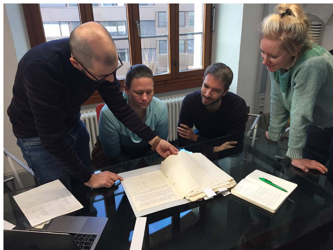
FIGURE 4 Postdoctoral workshop of 22 January 2020 at the Valais State Archives in Sion, Switzerland (Box 3). A historian (first on the left) shows to the natural scientists how to search and analyze archival data for mountain research.

policy toward a stronger support for inter- and transdisciplinarity (Taylor and Krause 2004; Sheate et al 2008; Björnsen Gurung et al 2012; Gleeson et al 2016). Thus, the criteria used to evaluate applications for academic positions and research projects should be revised at the level of research centers, universities, and national and international funding schemes.