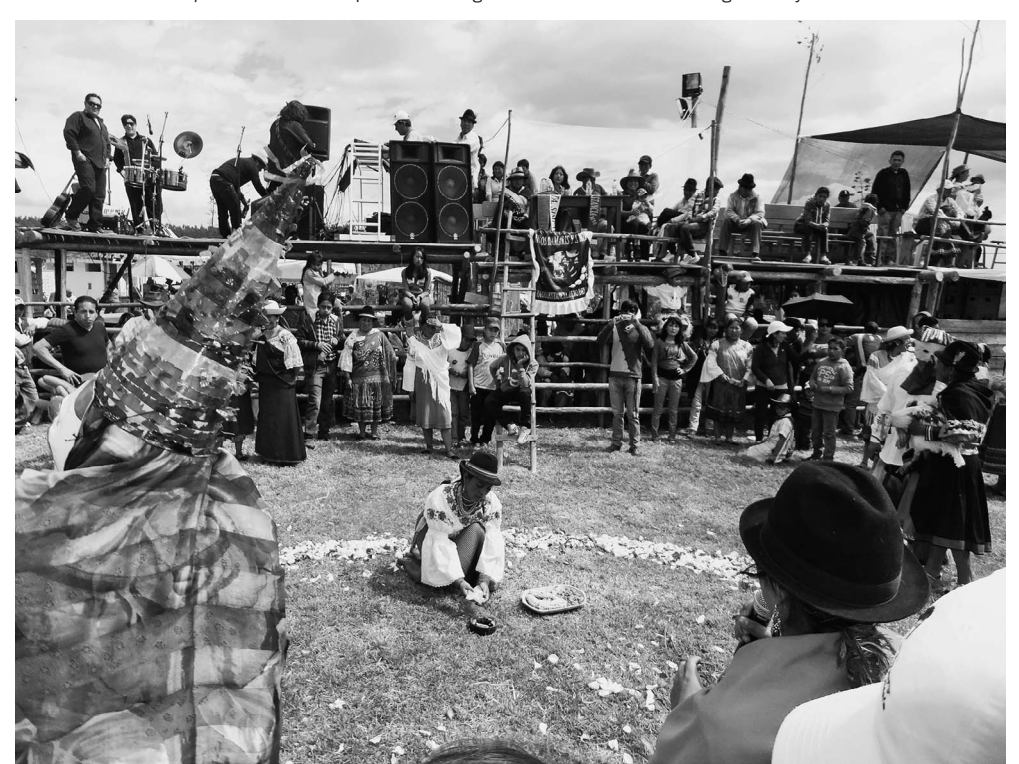
FIGURE 3 A toros del pueblo event in Paquiestancia begins with a traditional blessing done by the leader of the community (June 2014).

cultural identity and community cohesion. Indeed, the yearly summer festivals in the region, including San Pedro, San Juan, and Inti Raymi, feature competitions of chagra skills and ganado bravo in a series of events. Known colloquially as toros del pueblo , these events often begin with local indigenous traditional ritual blessings (Figure 3). Although many people