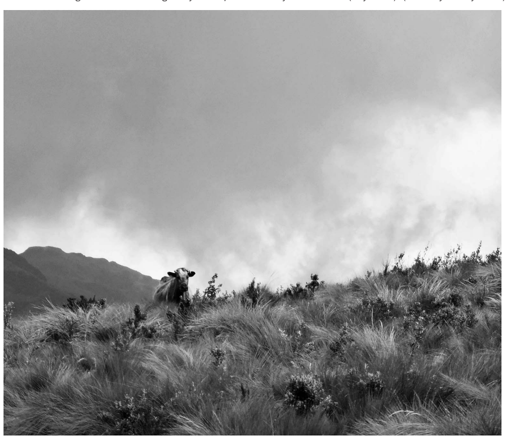
FIGURE 2 A lone ganado bravo roaming freely in the páramo on Cayambe volcano (July 2012).

supported projects in various communities in the region to improve and intensify dairy production. In Paquiestancia, this included a proposal for a pasture-seeding program to allow more intensive grazing on smaller properties near homes at lower elevations (FONAG 2011). In other Kayambi communities, it has included the support of improved pastures as well as veterinary care.