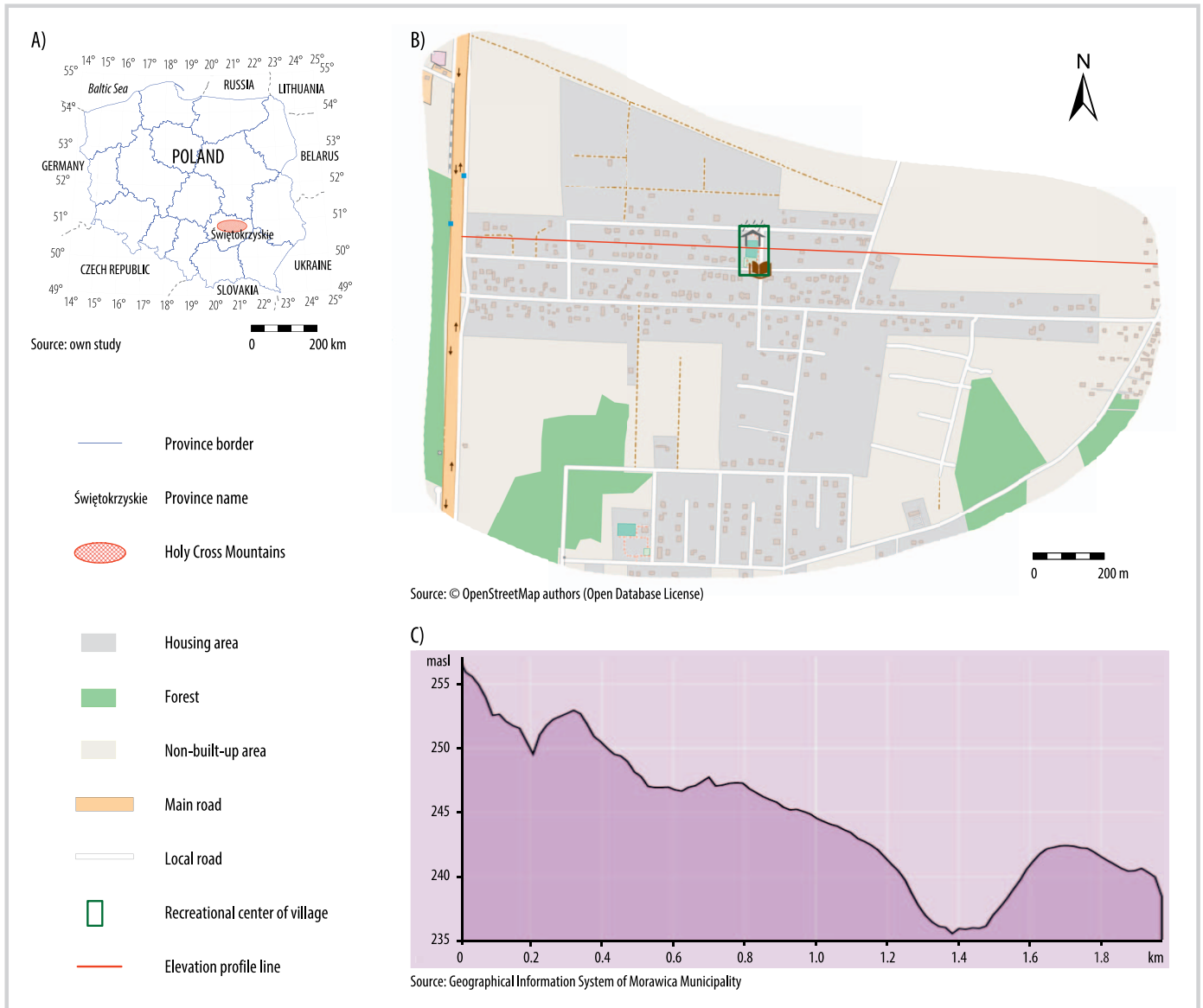
FIGURE 1 (A) Map of Poland showing the location of the case study; (B) case study site of Piaseczna Górka; (C) elevation profile of Piaseczna Górka.

population growth is the result of the developing residential function of the Morawica municipality, especially its northern part bordering Kielce, which is where Piaseczna Górka is located. According to rural development monitoring typology (Stanny et al 2021), the Morawica municipality belongs to type 6: suburban with reduced agricultural function.