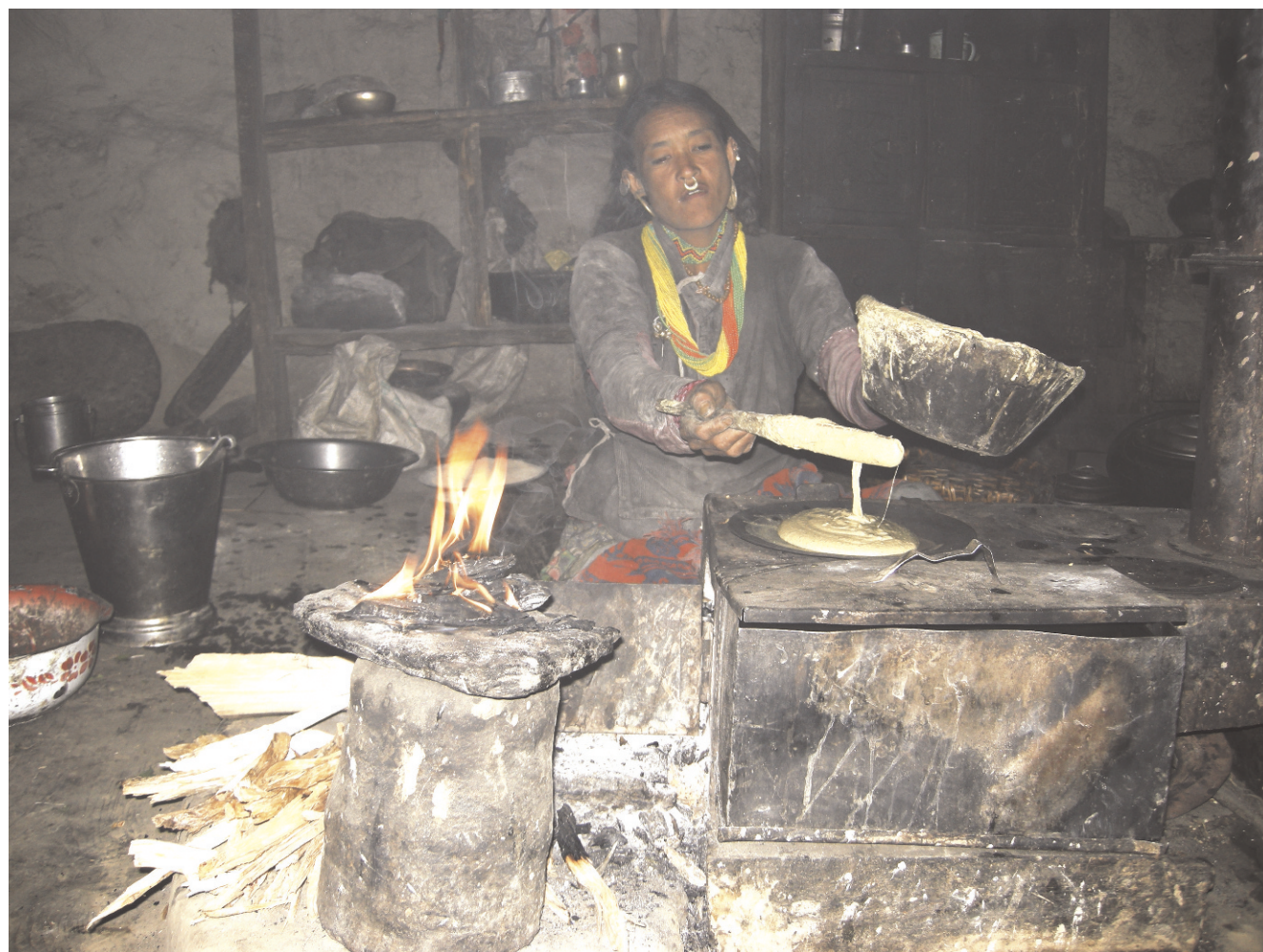
FIGURE 3 Woman preparing lakkad made from bitter buckwheat.

rice and boost cultivation of local grains, HDI promotes indigenous and nutritious foods such as lakkad (pancake made from bitter buckwheat) (Figure 3) and saatu (barley flour which is taken with Tibetan butter tea).