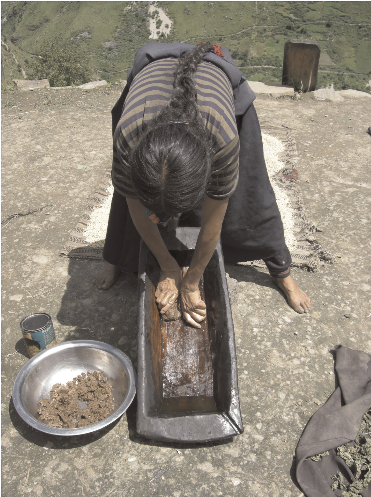
FIGURE 4 Manual extraction of oil from walnut kernels.