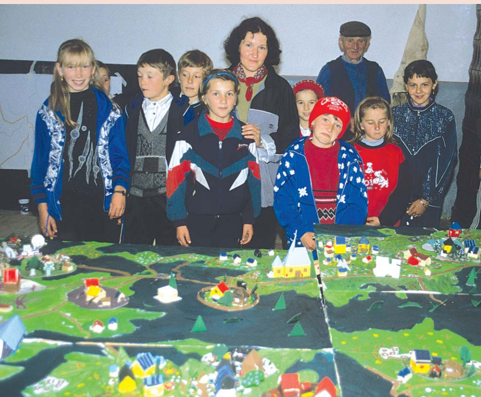
FIGURE 3 “Planning for real:” Ghețari pupils display their 3-dimensional vision of their village in the future. This model served as a tool for further discussion with their parents and other stakeholders.

financial instruments, and better marketing strategies are implemented. Successful regional development will be the most convincing argument in the transfer of results to other rural mountain regions of Eastern Europe.