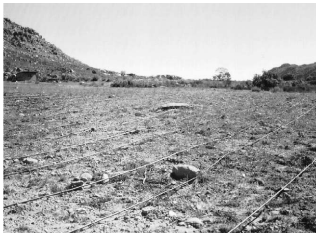
FIGURE 3 Cultivated buchu in Elandskloof.

local distilling company, the government agency Agricultural Research Council (ARC), and an overseas donor. The community of Elandskloof is only one of several pilot projects for this initiative in the area. The pilot project in Elandskloof began in 2004, with 8 households whose selection was based, among other things, on the suitability of their land for buchu growing and the availability of skilled labor. This selection of only 8 pilot households from a total of 85 has caused numerous local conflicts, as well as conflicts between locals and outside partners in the project. The fact that most of the pilot households are either members of the executive of the CPA or relatives of members, or regarded as an elite by other villagers, further fuels discontent among the rest of the community of Elandskloof.