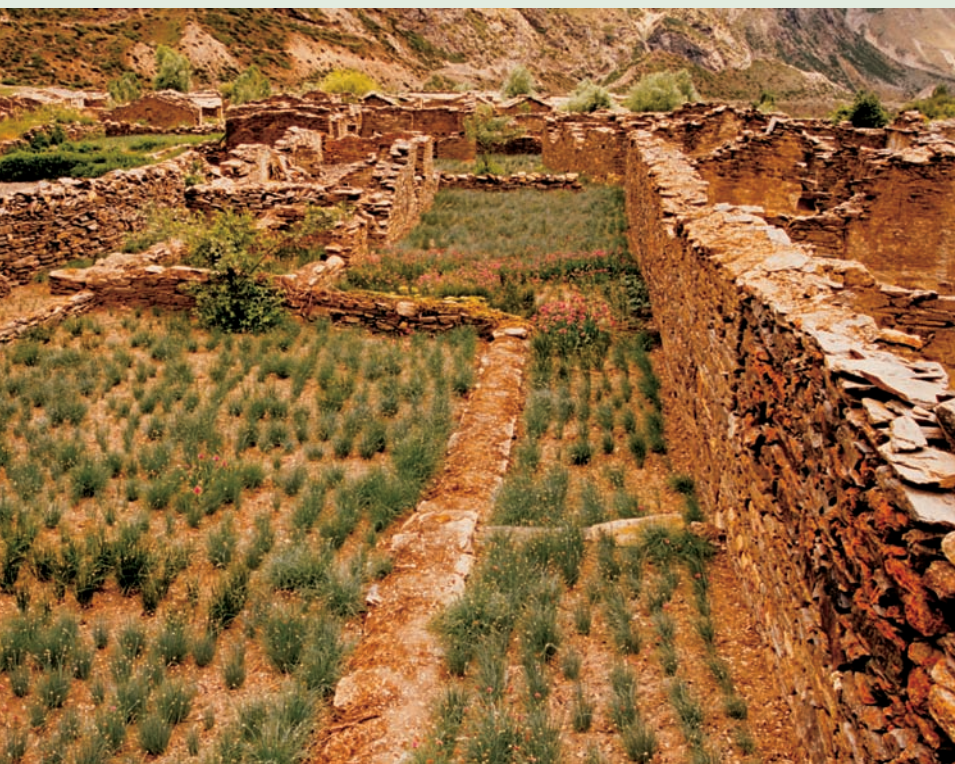
FIGURE 4 Village ruins provide secure sites for the cultivation of Carum carvi , Allium stracheyii , and a few other medicinal plants.

While the decline in the cattle population is not too perceptible, a drastic decline in the sheep population has taken place, with a consequent effect on the traditional art of weaving, as it has become very difficult to procure even small amounts of raw wool. The total sheep population has dwindled from 15,949 in 1987 to a mere 2813 at present, a decline of 82%. The present size of sheep herds (average 50–100 per family) is no longer remunerative, and sheep exist more as “an excuse to lead the lifestyle we are accustomed to” and “to enjoy the bliss of alpine meadows,” as some local people have expressed it.