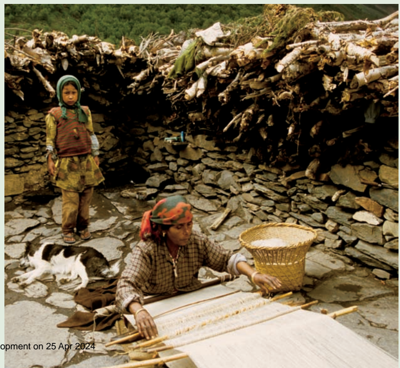
FIGURE 3 The traditional art of weaving is no longer a profitable source of income, but it is being kept alive nevertheless.

The very livelihood of these people is intricately woven around the number and health of livestock, which provide wool and thus clothing, are the only means of transportation, and, to a lesser extent, play a significant role in nutrient cycling.