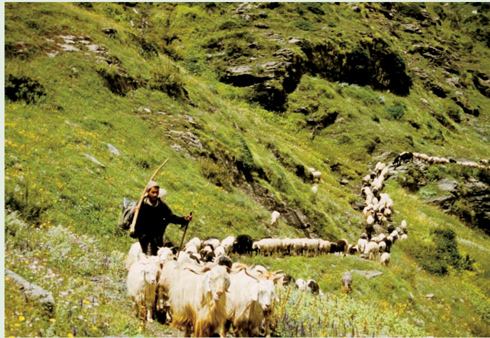
diversity of wild plants and crops in the 2 valleys after 1962.

The present study was carried out to ascertain the radical changes in transhumance patterns, livelihoods, the extent of cultivation of MAPs, and exploitation of the