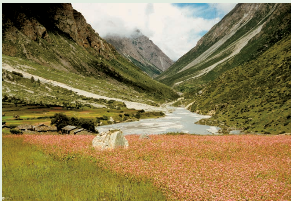
FIGURE 5 Palthi ( Fagopyrum esculentum ), cultivated extensively in the Darma valley. The same crop is completely absent from the Johaar valley, having been replaced by the more remunerative thoya ( Carum carvi ) and jambu ( Allium stracheyii ).

Meanwhile, cyclical harvesting from the wild, protecting some patches from harvesting for a period of 2–3 years, would go a long way towards conservation of the MAPs. This is being practiced by the van panchayat (village forest council) in the village of Ralam, which has demarcated its entire van panchayat forest into 7 different zones, each harvested only once at intervals of 3 years. This not only lessens the pressure on wild species of MAPs, but also allows the plants to grow to maturity, since most of the selected MAPs require at the most 3 years to mature. The harvest cycle