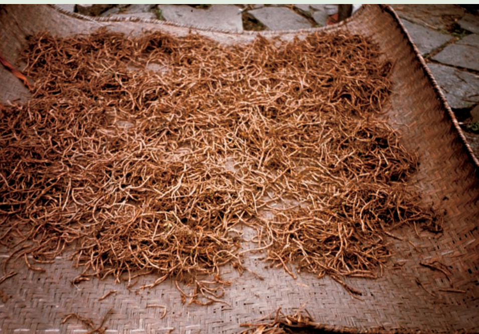
FIGURE 6 The most heavily exploited medicinal plant species, kutki ( Picrorrhiza scrophulariflora ).