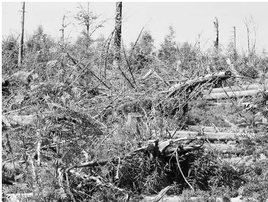
FIGURE 1 Dynamics of natural reforestation along the “Lothar” trail in the Black Forest, Germany: within a few years of the devastating 1999 storm, young trees could be seen thriving between the dead wood left lying on the ground.

Because a storm-devastated forest area can only be observed safely from a distance, an adventure trail had to be constructed to make the area accessible to the general public. This trail now provides thrilling insight in the form of a fixed rope route, leading over and under fallen trees. By contrast with the still very