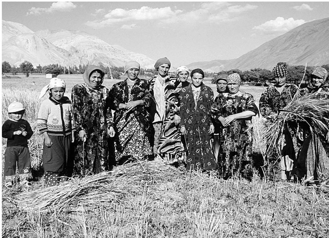
FIGURE 3 If empowered and informed, Muslim women in Tajikistan as well as elsewhere in mountainous Central Asia can play a key role in helping to redress the erosion of seismic culture.

that the Kashmir Earthquake occurred because, as many put it, “it was God’s will” and “God’s will and destiny chooses who survives and what places get destroyed.” There was also a disturbing campaign alleging that one of the reasons for the Kashmir Earthquake was women’s sins, inappropriate behavior, and dress. The lack of sound information can lead to blaming these types of events on metaphysical phenomena or social groups rather than focusing attention on the physical hazard, preparedness, and planning. When asked from where they received information regarding relief and reconstruction, the majority of respondents indicated that they had no place to go to collect such information. Nevertheless, tremendous concern exists with regard to the safety of structures and communities in the future. One 30-year-old male teacher in a local school put it this way, “this area is not safe. People are tense and tremors make people worry. Areas should be planned to be safer.”