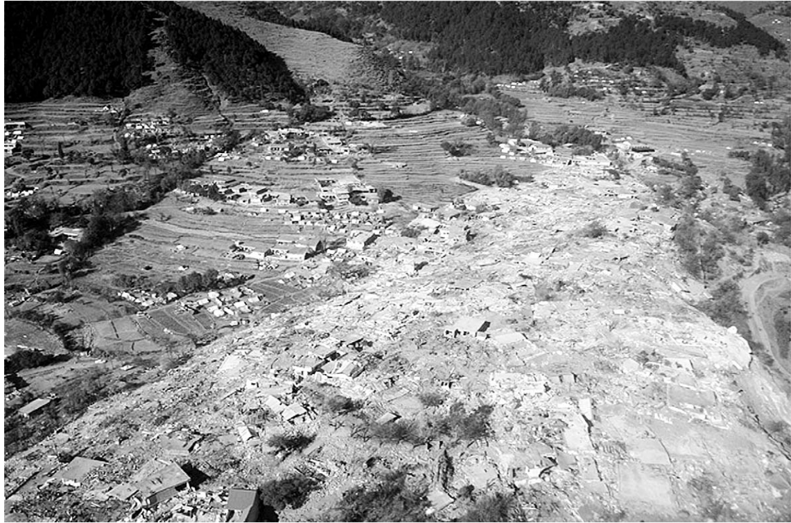
FIGURE 1 The population of Balakot in the North-West Frontier Province was particularly vulnerable to the 8 October 2005 earthquake. A significant proportion of the damage to this urban area was attributed to the siting of structures on the active fault as well as to the lack of seismically appropriate engineering methods and poor quality construction. (Photo by L. Owen, November 2005)

structure, destroyed agricultural land, and buried villages. The Hattian Bala landslide, recorded to be over one kilometer long and over 200 meters wide, was of massive proportions (Owen et al 2007). Within seconds, 4 villages with approximately 450 residents were overtaken and completely buried in landslide debris. The landslide created dams that blocked 2 drainages of the Jhelum River and led to the formation of 2 potentially hazardous lakes (Owen et al 2007).