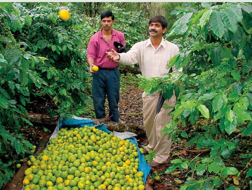
FIGURE 5 Coorg orange harvest: planters used to grow orange as a single crop. It is now grown in association with coffee, even though both crops have different shade requirements.

stand today, the Coorg Orange GI may have prevented this local variety from disappearing. However, several conditions