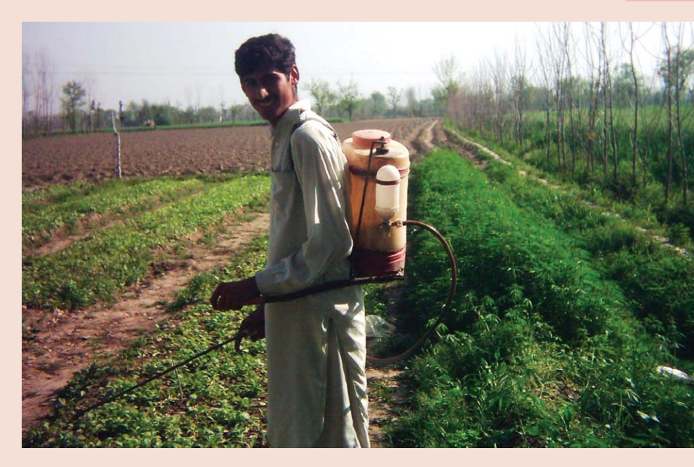
FIGURE 2 Farmer applying pesticides in his field without using protective measures.

This is effective to discourage unwanted herbs and herbicides. If herbs increase and dominate over a crop, farmers can cut the crop before maturity. This way the seedlings of unwanted herbs do not spread in the soil. Premature cutting is a