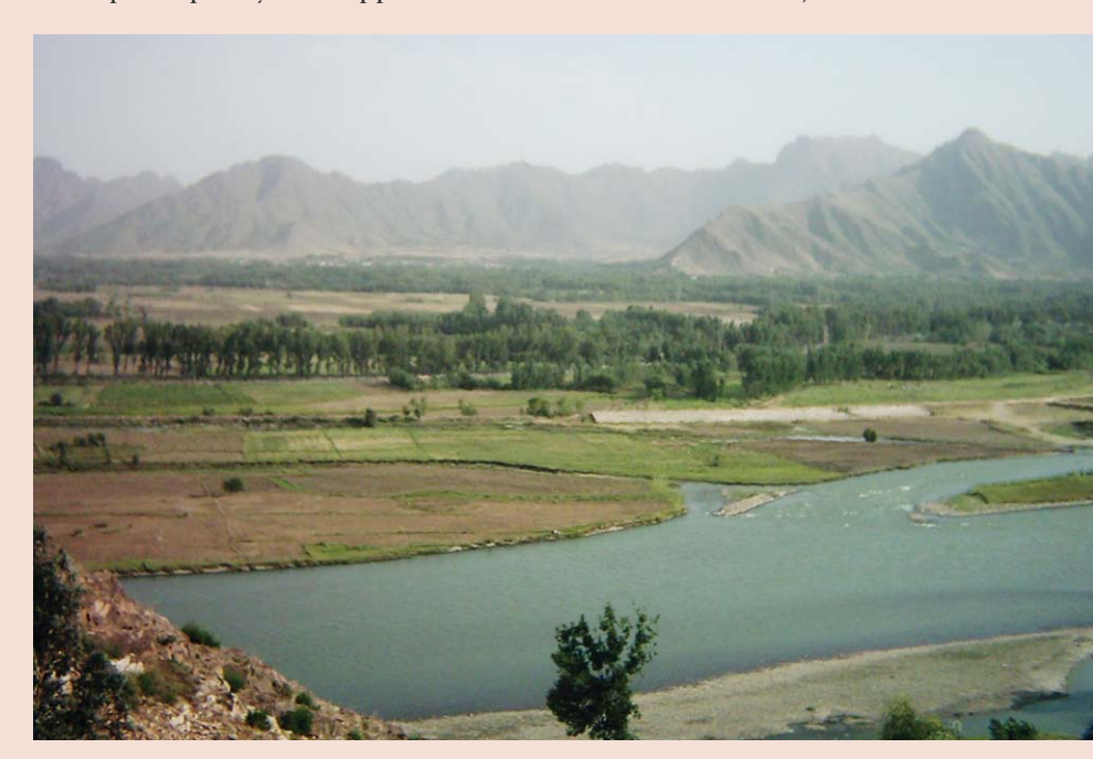
FIGURE 1 The Swat river at Chakdara, looking South: agricultural land in the lower Swat Valley is affected by pesticides. In addition, concentrations of pesticides in the Swat river are increased by input from the upper Swat Valley, where steep slopes are prone to leaching, releasing high concentrations of chemicals.

Soil samples were collected from 12 villages and analyzed for 12 different pesticides using a Gas Chromatograph equipped with an electron captured detector (ECD). In order to know how pesticides are used in Swat Valley and how they affect apiculture, fish, and birds (especially starlings), a comprehensive survey was conducted in 12 villages: 216 farmers were interviewed, corresponding to 10% of the farmer community. The interviews were supplemented by 15 transit walks in 3 seasons (5 walks per season), in addition to other participatory rural appraisal tech-