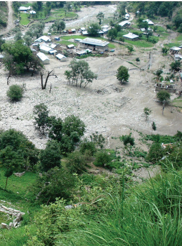
FIGURE 2 Debris flow in March 2007 caused further damage to shelters built after the earthquake at Nardajian (upper valley). (Photo by Markus Zimmermann, 15 July 2007)

Although such events occurred in the area before the 2005 earthquake, as expected, they have become more frequent and intense since the earthquake and are causing more damage (Sudmeier-Rieux et al 2008). Moreover, the human impact on slope stability (such as through road and water channel construction) is another important triggering factor that should not be underestimated (Owen et al 2007). In addition, landslides are transporting large amounts of sediment into river systems and gullies. The consequences—debris flows and riverbed aggradation—are raising the flood hazard level in many locations.