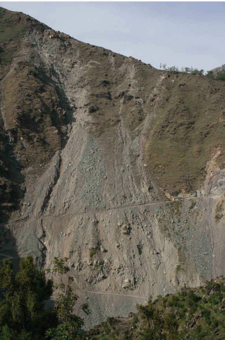
FIGURE 3 Landslide affecting the road to the upper Chakhama Valley. (4 April 2007)