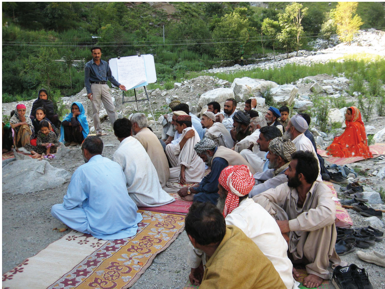
FIGURE 5 Discussion of localized hazard assessments with communities in one of the villages. (Photo by AKDN, 12 September 2007)

crossing of countless rivulets and gullies constitute a major challenge for engineers. The sites of particular structures (schools, basic health units, water supply systems) were assessed and recommendations made to enable engineers to choose appropriate locations and improve overall structural safety (see Box 1). Linear structures (canals, roads) were systematically checked for geotechnical threats (slope failures, landslides, rockfall, debris flows). Each section that was prone to failure was described, and recommendations were outlined (see Box 2).