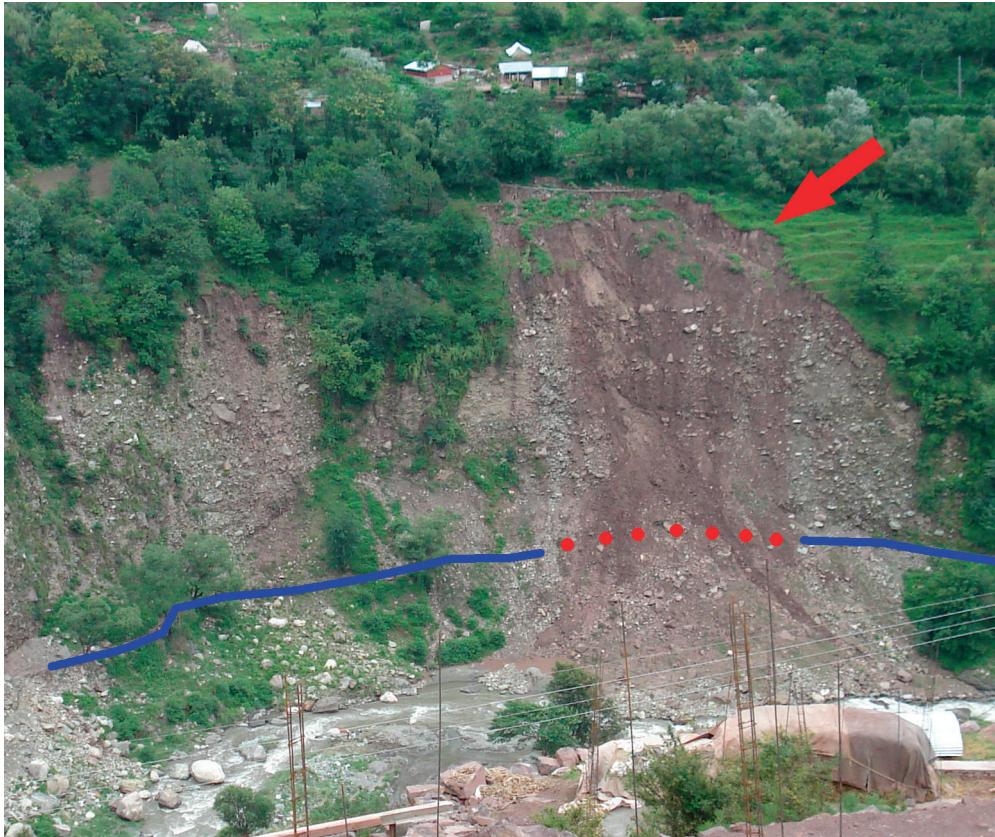
FIGURE 6 Kathai irrigation canal (blue line); most critical section for rehabilitation (red dots) with highly unstable slope above (arrow).