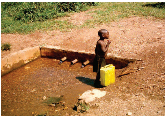
FIGURE 3 Poor maintenance: the immediate surroundings of this protected spring are not maintained. This affects both water quality and yield.