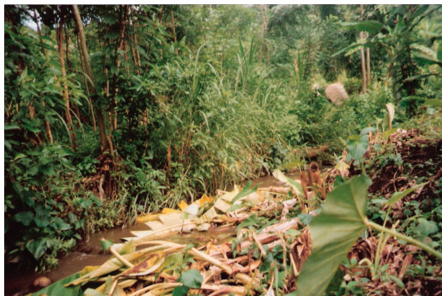
FIGURE 2 Encroachment: banana, yams, and eucalyptus trees planted along the Mpondwe River in Kasese district.

Nyamwamba River in Kasese, the Mugwanjura Gravity Flow Scheme in Ntungamo, and the Rwizi River in Mbarara were found to be experiencing drastic water reduction. This water crisis is further aggravated by environmental degradation in the form of high soil erosion rates, and the reported decrease of the water table leading to nonfunctionality of public water works, as well as a change in local climatic conditions. For example, Mzee Karoli Kanyinondi (72) of Mbarara explained during an interview that the dry season—which used to occur in July–October in Ankole—can no longer be predicted and now occurs at any time. As a result, all districts visited reported seasonal shortages of food due to crop failures and unpredictable rains.