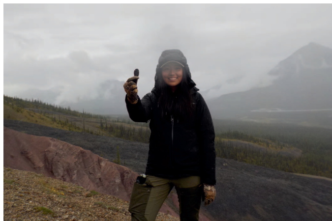
FIGURE 5 A Sahtu student holds a stone tool that she found associated with a sheep fence site on the mountain known to the Shúhtagot'ine as Pietl'ar'nejo during the 2021 field campaign for the Shúhtagot'ine Cultural Landscape Project.

Archaeological research can also evoke the “landscape memories” held within cultural landscapes. The conceptual framework that Lindholm and Ekblom (2019: 3) developed for biocultural heritage—a concept closely related to the idea of a cultural landscape—categorizes archaeological sites as landscape memories, which they define as “tangible materialized human practice and semi-intangible ways of organizing landscapes.” Landscape memories are 1 of 3 “memory reservoirs,” which also include “ecosystem memories” and intangible “place-based memories” such as place names. Lindholm and Ekblom (2019) encouraged practitioners to explore these memory reservoirs—and the linkages between them—in order to mobilize the knowledge that they hold toward contemporary landscape management. The case studies presented above wove landscape memories and place-based memories together to identify places where humans and caribou have come together over many generations. Unlocking these memories through collaborative archaeological research at fence sites has led us to recognize previously unrecorded mineral lick areas that can now be managed more effectively through available land management mechanisms. Evoking the memory of the long relationship between caribou, humans, and perennial ice in K'at'ieh has brought attention to the contemporary implications of the rapid decline of alpine ice patches.