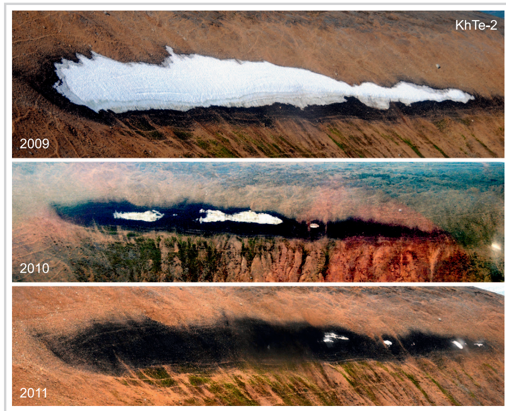
FIGURE 4 The rapid decline of permanent ice at KhTe-2 between 2009 and 2011. In 2011, only a thick carpet of caribou dung remained by late August.