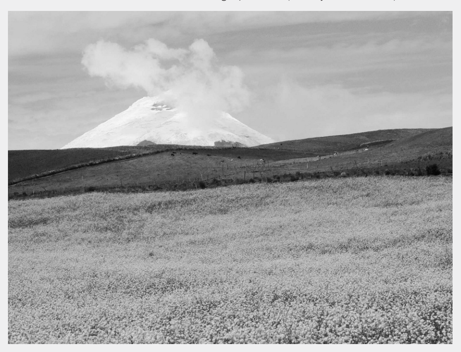
FIGURE 2 A field of canopy grass at the foot of Cotopaxi Volcano in Ecuador is one of the places where CONDESAN's Andean Paramo Initiative is being implemented.