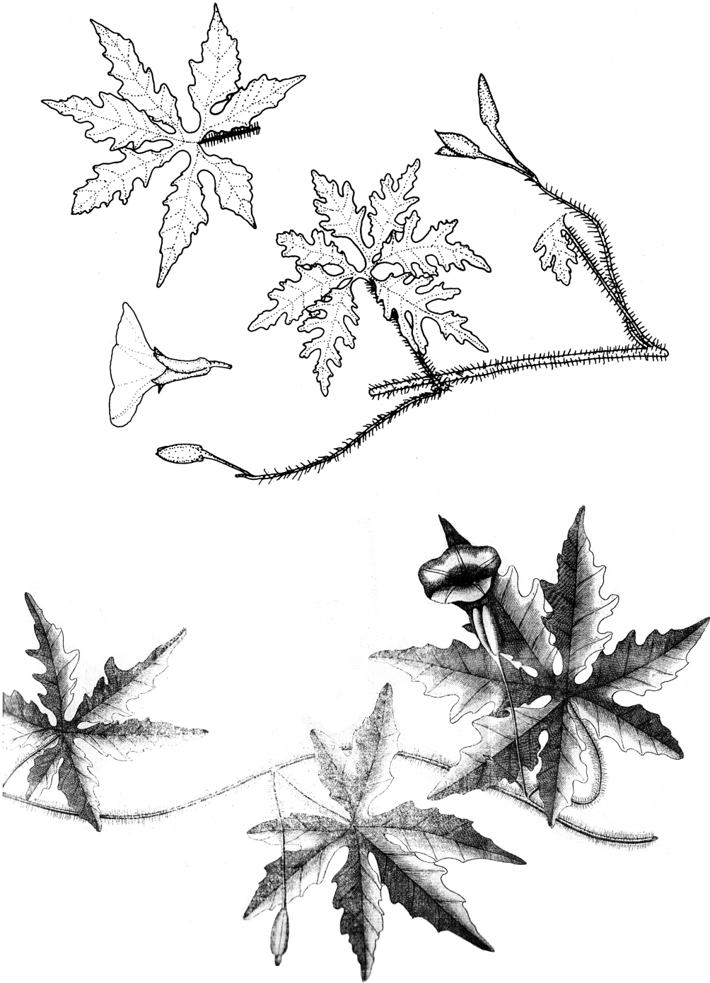
Fig. 1. Merremia dissecta Left, original drawing by Jacquin (1767). Right, by author (Austin 1979).