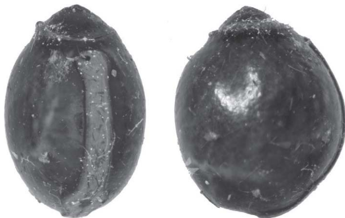
Fig. 2. The single, unbroken E. tiaratum egg collected from the manure of a chicken.

or shell halves of the R. artemis eggs and three whole but crushed, R. nematodes eggs were recovered from the quail manure (Fig 3). All other eggs had been digested beyond recognition. In total, out of 935 eggs fed to the birds, 884 were eaten (94.5%), and of these, only one (0.11%) passed the gut whole enough to remain viable.