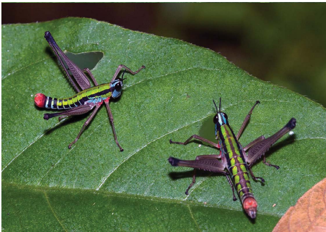
Fig. 2. Episactus nr tristani (pair). El Limo coffee plantation, ca 15 km N of Metapán. 23 August 2011. For color version, see Plate VIII.

E. tristani is the most widely distributed species, extending from El Salvador to central Costa Rica (the type locality). It is an unmistakable species (Fig. 2): small, apterous, striped longitudinally in black and white or yellow or iridescent pale green, with an orange-red tip to the abdomen, a dark blue and black head, and pale blue thoracic pleura. The larvae, in contrast, are dull brown and very cryptic. E. tristani is unusual among grasshoppers in that females are often more brightly colored than the males, these tending towards