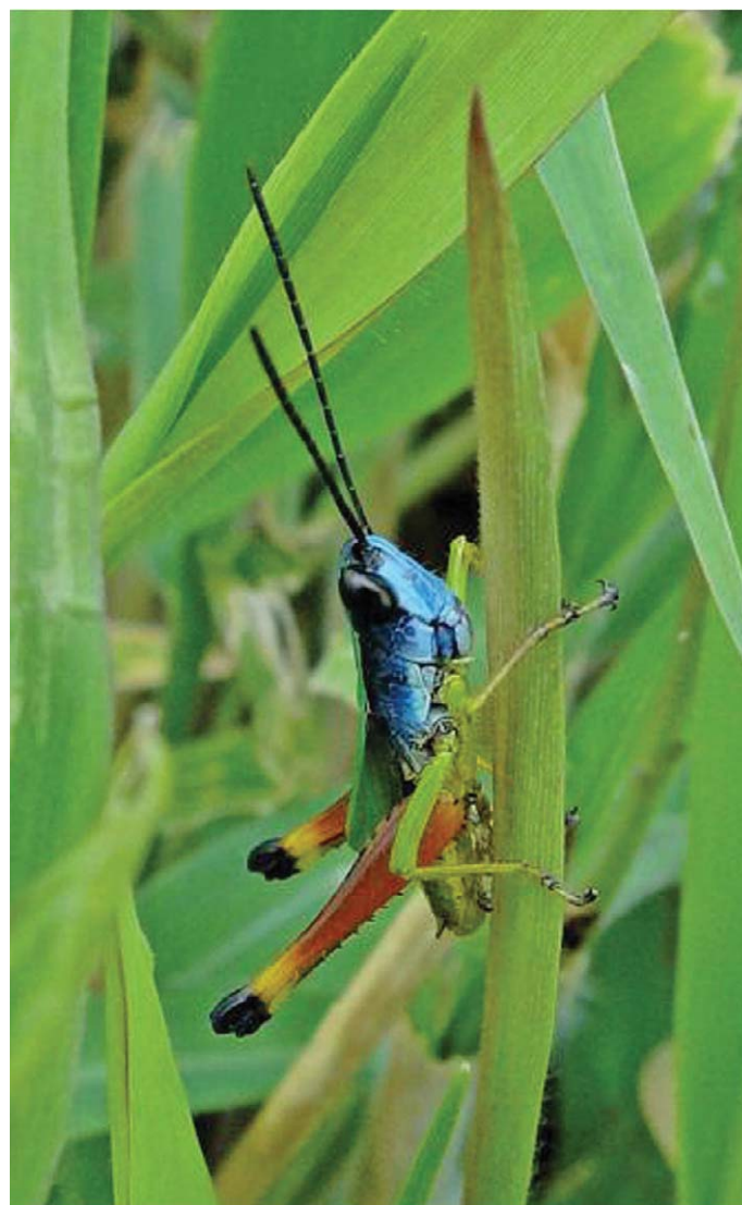
Fig. 9. Phaneroturis cupido . El Limo coffee plantation, ca 15 km N of Metapán. 25 June 2011. Silvia Figueroa. For color version, see Plate IX.

Phaneroturis cupido (Fig. 9) is a small gomphocerine with remarkably modified venation on its reduced hind wings. Previous collections were from southern Mexico and Guatemala (Otte 1981). It recalls Silvitettix in its habitus and natural history. We found adults