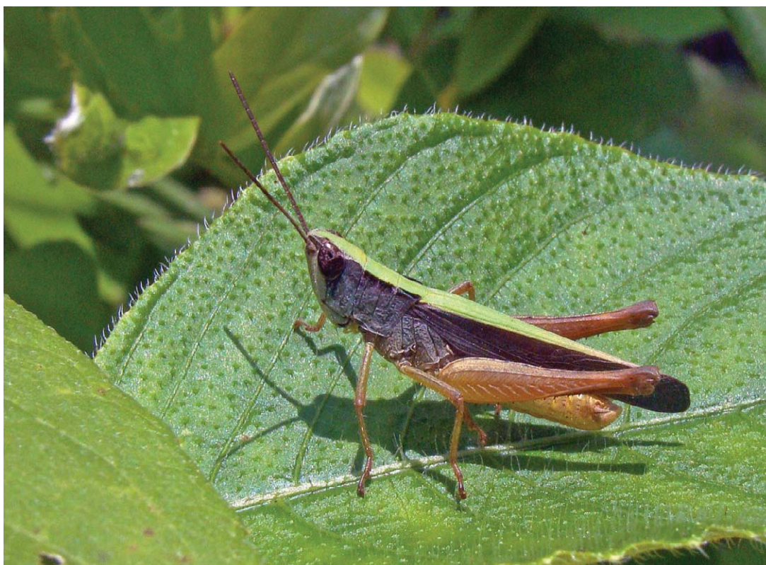
Fig 11. Orphula azteca (male). Hacienda los Puentes, 11.3 km W of Metapán. 22 August 2011. For color version, see Plate IX.

Machaerocera mexicana (Fig. 10) is an earthen-brown oedipodine with strikingly deep blue hindwings. Unlike most members of its subfamily, it associates more with understory vegetation at forest edges than open ground. In Middle America, it has been recorded in Mexico, Belize, and Guatemala (Otte 1984), from near sea level to montane settings, in both riparian habitats and on more open