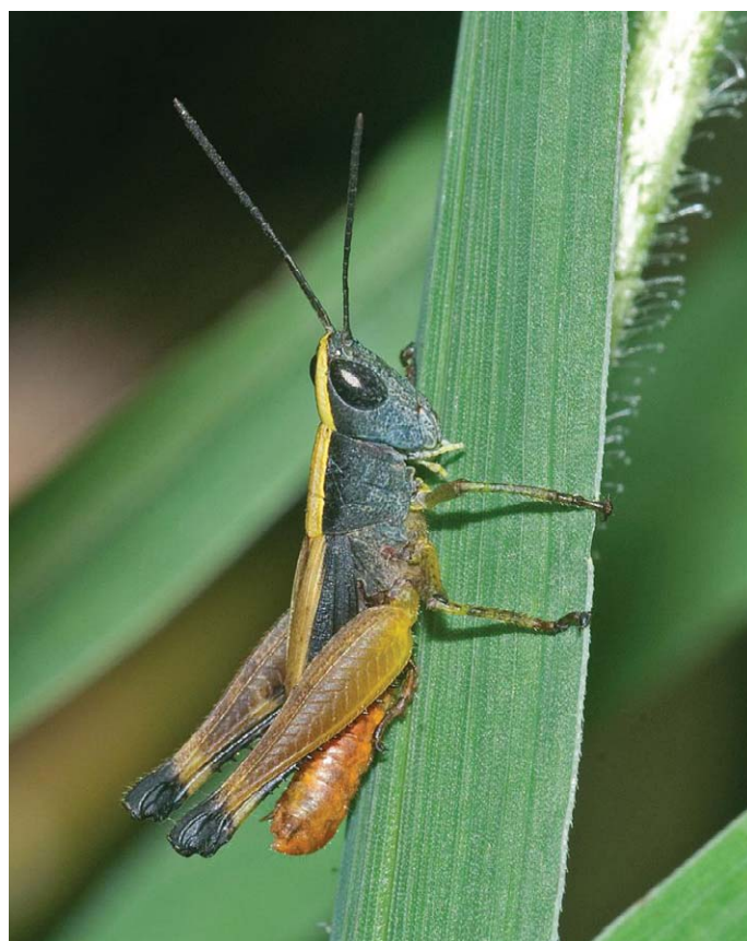
Fig. 8. Silvitettix thalassinus (male). El Limo coffee plantation, ca 15 km N of Metapán. 23 August 2011. For color version, see Plate IX.

tibiae. It appears to be close to the Mexican species P. gracilis . We are hoping to collect more specimens before describing it. All our localities were in or at the margins of relatively low-lying woodland, at around 500m elevation.