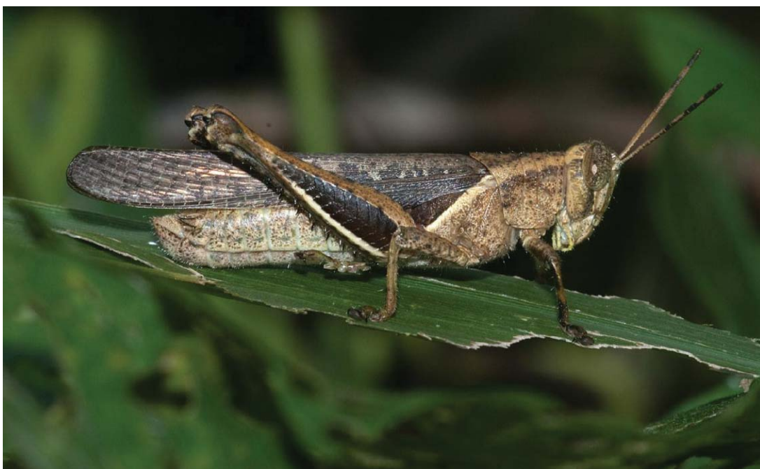
Fig. 13. Abracris flavolineata. San Diego La Barra Nat. Park, ca 10 km SW Metapán. 29 August 2011. For color version, see Plate X.

Orphula is a genus represented by six species distributed from Northern Mexico through Central America to Colombia and Venezuela, and again in Paraguay, Argentina and Brazil. The El Salvadorian species O. azteca (Fig. 11) is the common Central American member. It belongs to a New World group (the Hyalopterygini) of the subfamily Acridinae. These are suspected of actually being aberrant Gomphocerinae which have lost the diagnostic stridulatory mechanisms, but still have a hind wing modified to radiate the sound they no longer produce. Orphula can also be distinguished from several similar looking genera by the obliquely truncated tip