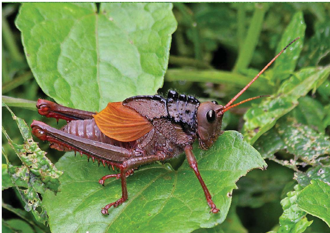
Fig. 5. Cibotopteryx variegata (female). El Limo coffee plantation, ca 15 km N of Metapán. 23 August 2011. Doug Danforth.

Courtship in E. tristani is elaborate and apparently visual; the male takes up a position with his long axis at 90° to the female (Fig. 2) and about 30 mm removed from her and opposite her pterothorax, and makes vigorous and accelerating "stridulatory" movements of the hind femora which, however, produce no audible