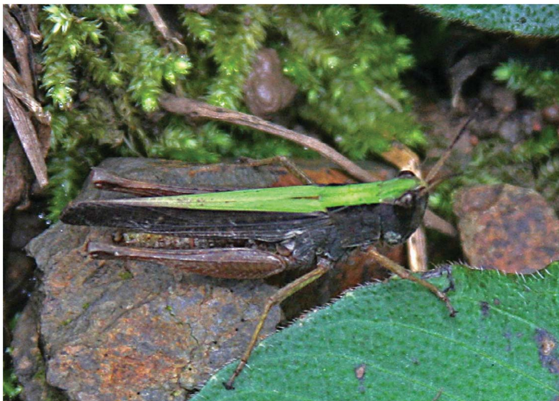
Fig. 12. Orphula azteca (male). El Limo coffee plantation, ca 15 km N of Metapán. 23 August 2011. Doug Danforth. For color version, see Plate X.