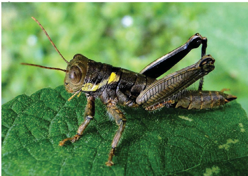
Fig. 1. Lempira metapanensis (male). El Limo coffee plantation, ca 15 km N of Metapán. 1 December 2010. Original image (see Rowell 2012, JOR 21(1) p. 20, Plate X) rotated 90° left. Silvia Figueroa. For color version, see Plate VIII.