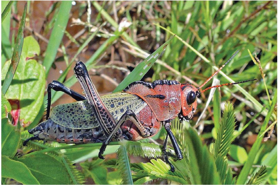
Fig. 6. Taeniopoda stáli . Hacienda La Portada, 17 km W of Metapán. 23 June 2011. Silvia Figueroa. For color version, see Plate VIII.

sounds. The male follows retreating females, apparently guided by her red "tail-light" marking.