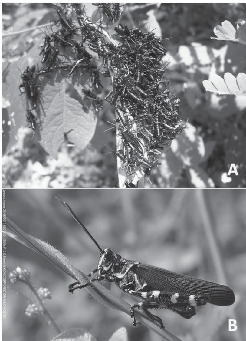
Fig. 3. A. Gregarious black nymphs of Chromacris speciosa perching on a host plant. B. Chromacris speciosa , adult male. For color version, see Plate XII.

taken advantage of by the principle of natural selection, and a case of "mimicry" set up, to become more and more perfect in time, as successive casual variations in the same direction increased the resemblance."