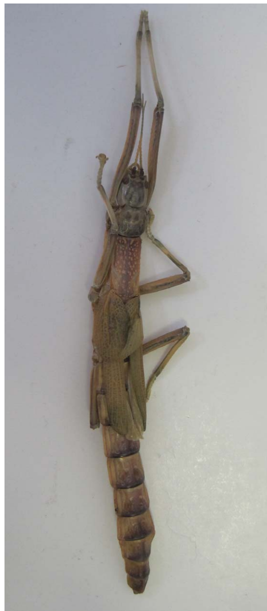
Fig. 2. Dorsal view of Megacrania tsudai Shiraki from Japan.