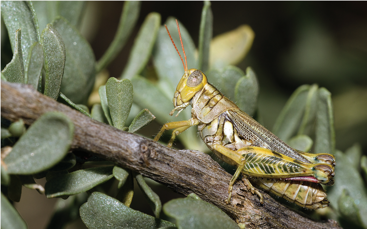
Fig. 1. Adult female Aeoloplides tenuipennis on fourwing saltbush, San Pedro Riparian National Conservation Area. Photographed 8 September 2015. (Photo Robert A. Behrstock/Naturewide Images).

basin surrounded by farmland and Chihuahuan Desert scrub/Desert grassland, receives ca 330 mm (13 in.) of rainfall/year (WeatherDB 2015) and collects runoff and sediments from surrounding North-South oriented mountain ranges. Alluvial soils adjacent to managed wetlands support extensive stands of fourwing saltbush. Other shrubs at the collecting site were a few small mesquites. Ground cover included plains bristlegrass, Setaria macrostachya (Poaceae), peppergrass, prickly Russian thistle, Coulter's horseweed, golden crownbeard, hairyseed bahia, Bahia absinthifolia (Asteraceae), burroweed, Isocoma tenuisecta (Asteraceae), silverleaf nightshade, copper globemallow, and trailing windmills. Specimens were collected by shaking foliage over the mouth of an insect net. The area sampled was ca 20 × 30 m and included both individual plants and clumps of fourwing saltbush. All visits to Whitewater Draw were made during mid-morning to mid-day and temperatures were ca 32 °C (90 °F).