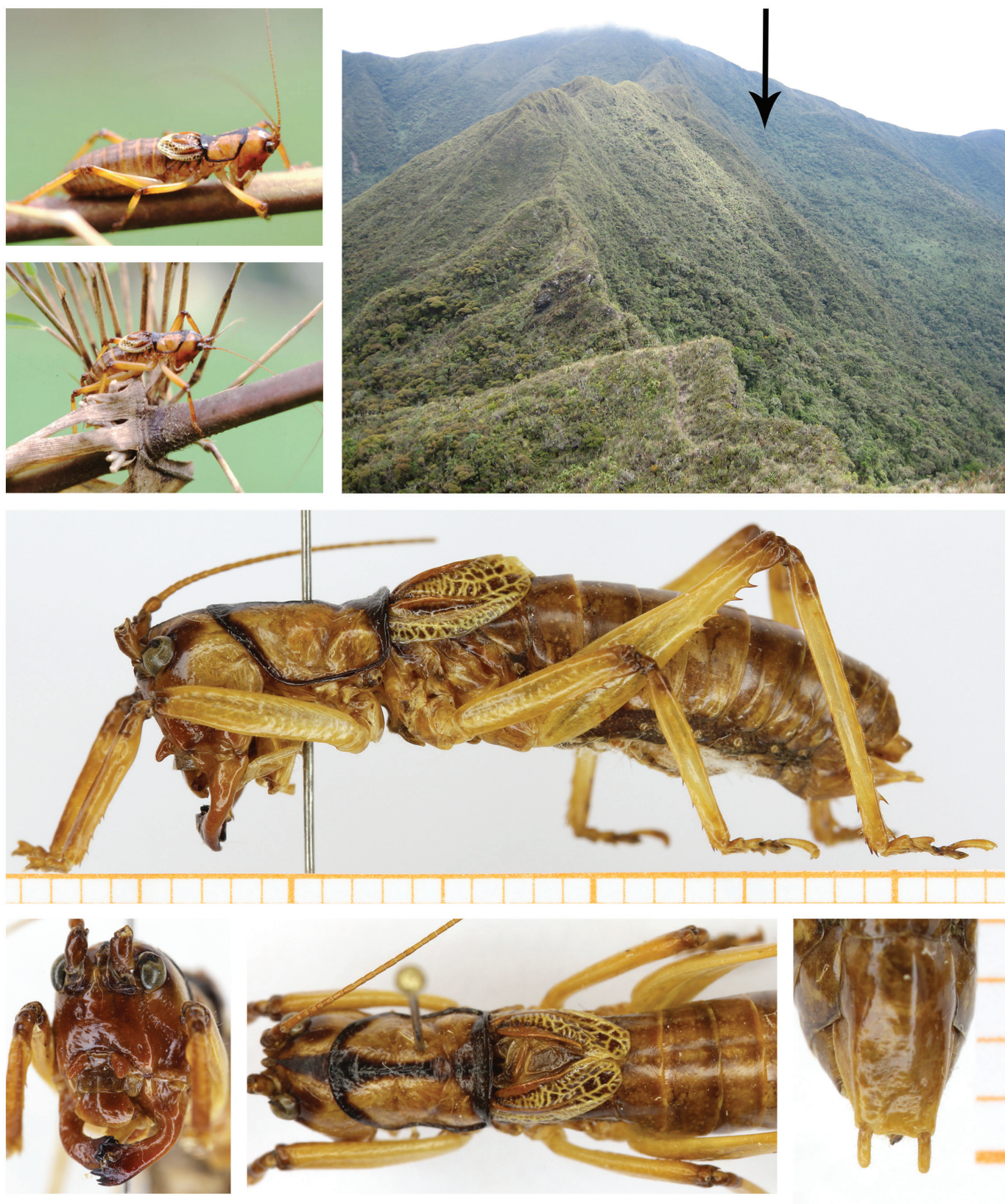
Fig. 1. Male of Disceratus nubiger : Two staged photos during day; locality on western slope of Cajanuma ridge at almost 3000 m (photographed in January 2010); specimen in lateral, frontal and dorsal view, and subgenital plate in ventral view (specimen cbt016s01).