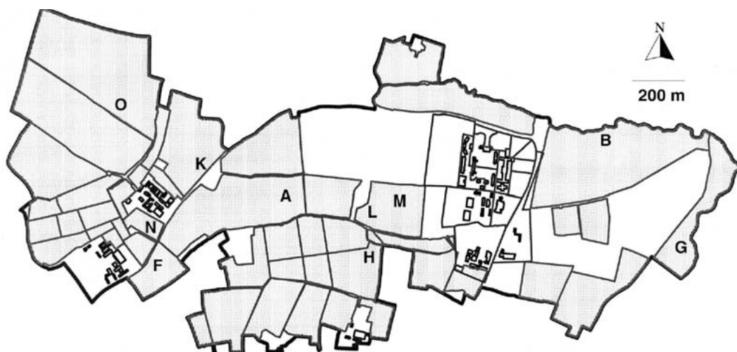
Fig. 1. Location of the study plots on the Writtle College Estate.

Sampling method for grasshopper populations. — In this study the method used for surveying grasshoppers was adapted from Ausden (1996) and Gardiner & Pye (2001). The size of the quadrats used in the survey was 4 m 2 (2 X 2 m). Ten quadrats were positioned using random co-ordinates in a 100-m 2 plot at each study site. The corners of each quadrat were marked using poles, without disturbing the grasshoppers within by casting shadows. Two types of plot were used: a standard 10 X 10-m plot and a linear plot of 5 X 20 m for grasslands such as roadside verges, where it was impossible to accommodate the former plot. Each plot at the study sites was surveyed to ascertain grasshopper abundance once in July and once in August, in both 2000 and 2001. Surveys were conducted in these months as adult grasshoppers are most abundant in midsummer. Only adult grasshoppers were recorded in this study because during this life stage identification can be confirmed without the capture of individuals (Richards & Waloff 1954).