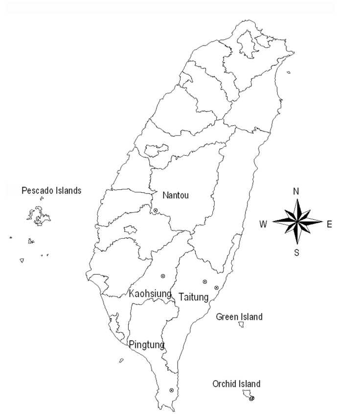
Fig. 13. Distribution of Alulatettix angustivertex , n. sp., in Taiwan. (⊙ = collecting localities).