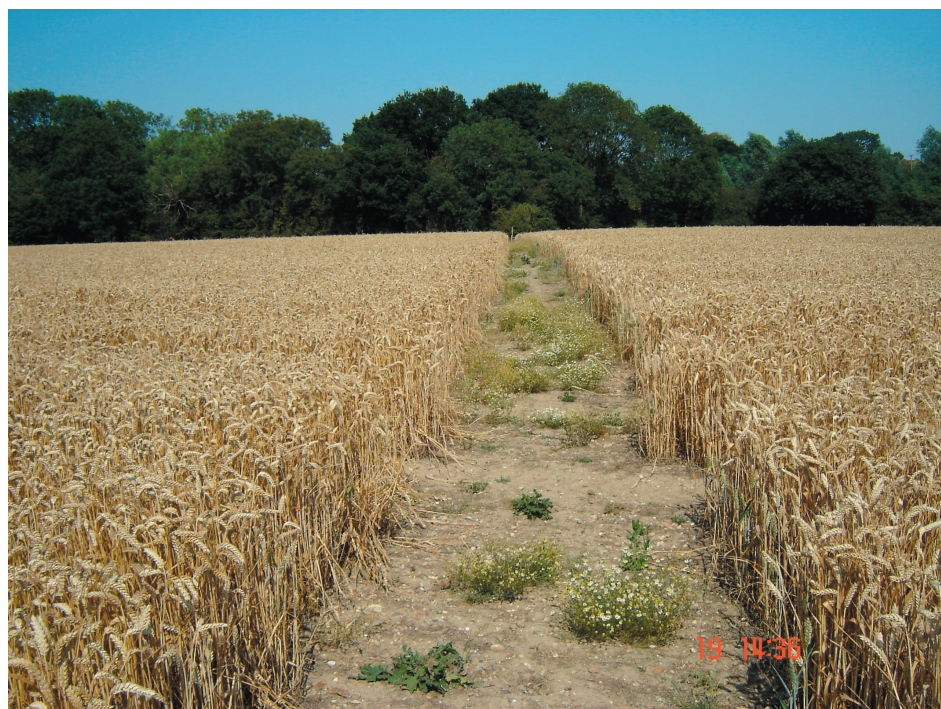
Fig. 1. Crossfield footpath (note the sporadic patches of vegetation). See also PLATE I.

*** grass margins established under the Entry Level Stewardship (ELS) scheme to promote biodiversity on farmland