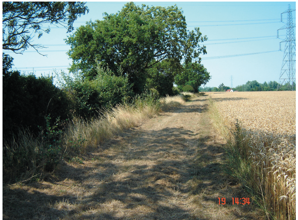
Fig. 2. Headland (field edge) footpath on the east side of a hedgerow. See also PLATE I.

Sampling of Orthoptera populations. —Transect methods for ascertaining Orthoptera abundance have been developed from butterfly transect techniques used for monitoring purposes (Pollard & Yates 1993) and are effective for sampling grasshoppers in short, open swards (< 50 cm in length) where adult densities are < 2 grasshoppers m -2 (Gardiner et al. 2005a). Orthoptera density estimates produced using transects are comparable to controlled techniques such as box quadrats, therefore the method can be used to reliably estimate Orthoptera density in the linear footpaths in this study (Gardiner & Hill 2006a). However, species richness estimates produced from transect counts need to be viewed with caution: surveyors tend to miss bushcricket species such as Roesel's bushcricket, Metrioptera roeselii , and the long-winged conehead, Conocephalus discolor , due to their ability to escape or hide from the observer before identification has been confirmed (Gardiner & Hill 2006a). The behavior of the sampler may also affect counts, as the transect walker is constantly on the move (except for short stops to record sightings) and unable to search the vegetation in any detail (Gardiner & Hill 2006a).