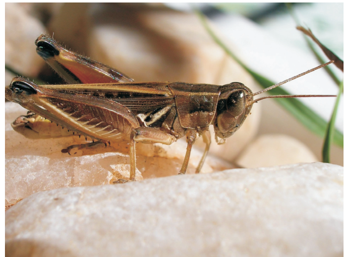
Fig. 3. Dichroplus pratensis male, as Fig. 2. See Plate IV.