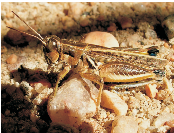
Fig. 2. Dichroplus pratensis male, natural population at Saladillo, San Luis, Argentina, summer 2006. See Plate IV.