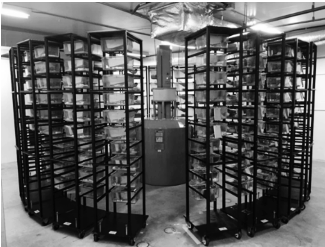
FIG. 2. Panoramic irradiator housed in a concrete shielded building (53 m 2 ) located at Colorado State University. The facility has a set-up of 18 racks that hold 10 cages with 5 mice per cage. The racks form an arc 180 cm from the source, providing capacity for up to 900 mice to be studied simultaneously.

Tissue analysis and echocardiography were also completed in rats that received low-dose-rate neutron irradiations in this facility (80). Male Long-Evans rats were evaluated by echocardiography immediately after 400 days of chronic neutron irradiation (total dose of 0.4 Gy). These studies showed no significant effect of radiation on left ventricular function or morphology; however, a small, but statistically significant increase in isovolumic relaxation time (indicative of slower myocardial relaxation) was seen. This finding was thought to represent the early stages of left ventricular stiffening and diastolic dysfunction, which typically precede wall thickening and systolic dysfunction.