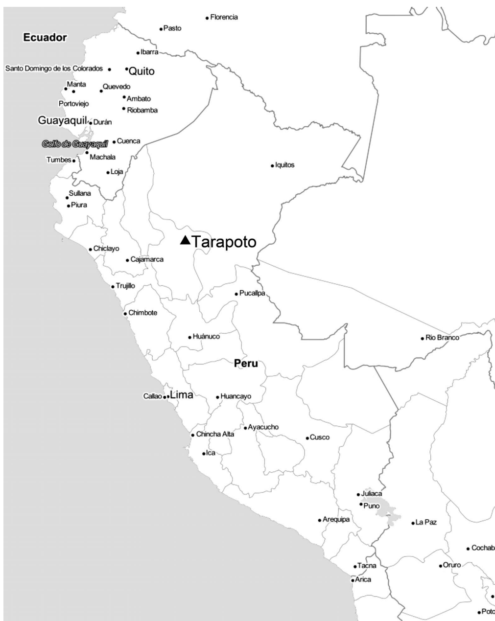
FIG. 1. Map of our study site near Tarapoto, in the Department of San Martín, in Peru. Tarapoto is indicated with a triangle.

visual model function provided in the 'pavo' package (Vorobyev et al., 1998) against the average reflectance of three Dieffenbachia leaves taken in the field. We chose to use Dieffenbachia reflectance because R. imitator frequently breeds in Dieffenbachia (Brown et al., 2008b) and all males were seen on these plants during this study. The visual model function is based on stimulation of different cone types, and assumes that color discrimination is in large part limited by receptor noise (Vorobyev et al., 1998). This calculation allows us to examine both chromatic (dS, color-based) and achromatic (dL, luminance or brightness) contrast to the background in units of just-noticeable differences (JNDs), a unit of differentiation in which JND = 1 indicates a difference that is at the threshold of discrimination for a viewer (derived from Vorobyev et al., 1998). We used the average avian visual system and ideal, white illumination in our visual model (data provided within 'pavo').