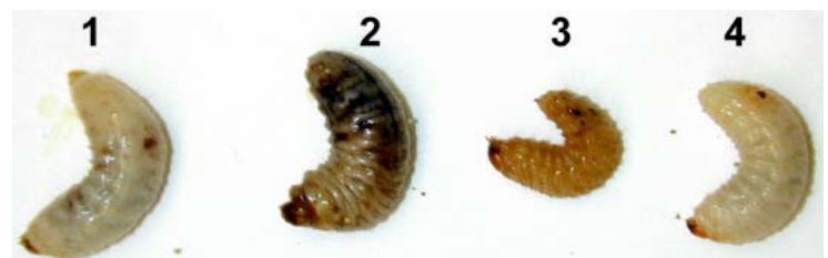
Figure 3. Larvae of the Diaprepes root weevil, 24 h post inoculation with homogenate from a iridescent virus-6 (IIV6) infected larvae, showing the range of pathogenicity. 1. Control larvae injected with water. 2. Larvae darkening, blackish color usually dies 3 - 4 d post inoculation. 3. Larvae yellowish color, usually dies 5 - 7 d post inoculation. 4. Larvae normal coloration, covertly infected, no visible symptoms.

Modes of transmission and persistence of iridovirus in nature are still being discovered (Williams, 1998). In this study, virus transmission between caged D. abbreviatus may occur through contamination of surfaces, contact during mating, or through the spiracles as an aerosol. Sexual transmission from males to females may be expected based on the observations by Marina et al. (1999) which reported sexual transmission of iridovirus in mosquitoes. Transmission of virus during sex may be accomplished during the transfer and absorption of proteins by females during mating (Harari et al. , 1999; Wolfner, 1997). Results show that infected females produced infected eggs, showing IIV6 can be vertically transmitted to the eggs. Vertical transmission has also been reported for iridoviruses in mosquitoes (Woodward and Chapman, 1968) and insect tissues found to be infected included ovaries, as well as the