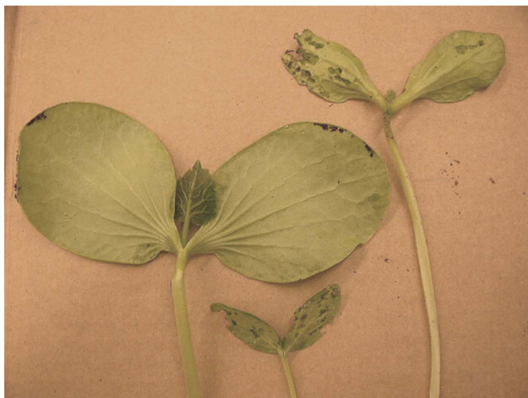
Figure 4. Photograph of squash ('Turks Turbin') (top left), cucumber ('Marketmore 76') (bottom center), and pumpkin ('Magic Lantern') (top right) plants from the laboratory no-choice feeding study. Note the decrease in cotyledon size and increase in intensity of Cerotoma trifurcata feeding damage from squash to pumpkin to cucumber. Damage to each plant was caused by ten C. trifurcata adults over 72 h.

squash plants, with pumpkin plants having an intermediate amount of damage (Table 1; Fig 4; 5). The percentage of plants with stem damage was significantly greater for cucumber and pumpkin plants compared to squash plants ( F = 5.00 , df = 2, 15 , P = 0.022 ), while the percentage of plants with damage to the first true leaf did not differ significantly ( F = 0.83 , df = 2, 15 , P = 0.45 ) (Table 1). Significantly more cotyledon area had distinct holes on cucumber plants than pumpkin or squash plants ( F = 11.88 , df = 2, 15 , P = 0.0008 ) (Table 1). The percentage of the lower ( F = 16.86 , df = 2, 15 , P = 0.0001 ) and upper ( F = 9.21 , df = 2, 15 , P = 0.0025 ) surface of the cotyledons scarred for cucumber and pumpkin plants was significantly greater than that of squash plants (Table 1).