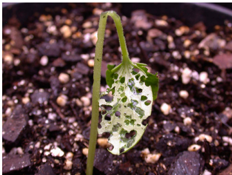
Figure 5. Photograph of a heavily damaged cucumber ('Marketmore 76') plant from the laboratory no-choice feeding study. Note the surface scarring and distinct holes in the cotyledon. Also, feeding damage to the stem resulted in the upper portion of the plant hanging downward. Damage to the plant was caused by ten Cerotoma trifurcata adults over 72 h.