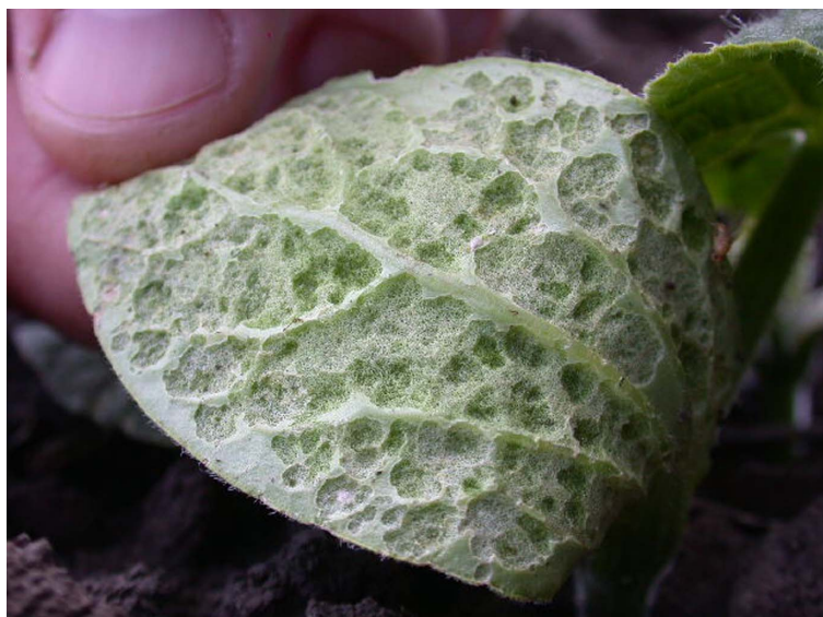
Figure 3. Photograph of the lower surface of a heavily damaged pumpkin ('Magic Lantern') cotyledon. Image was taken in a commercial pumpkin field near Rosemount, MN, 13 June 2003