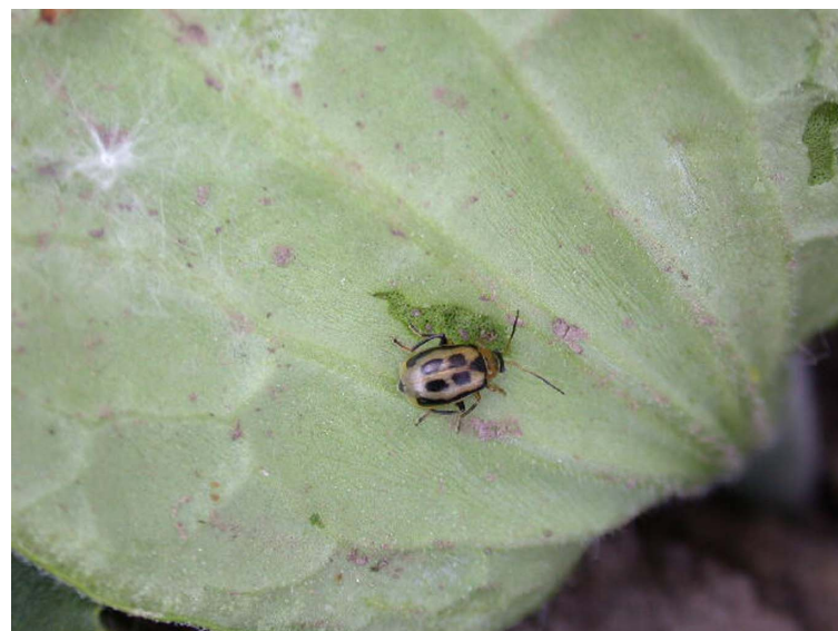
Figure 2. Photograph of an adult Cerotoma trifurcata on a pumpkin ('Magic Lantern') cotyledon with associated damage. Image was taken in a commercial pumpkin field near Rosemount, MN, 13 June 2003.