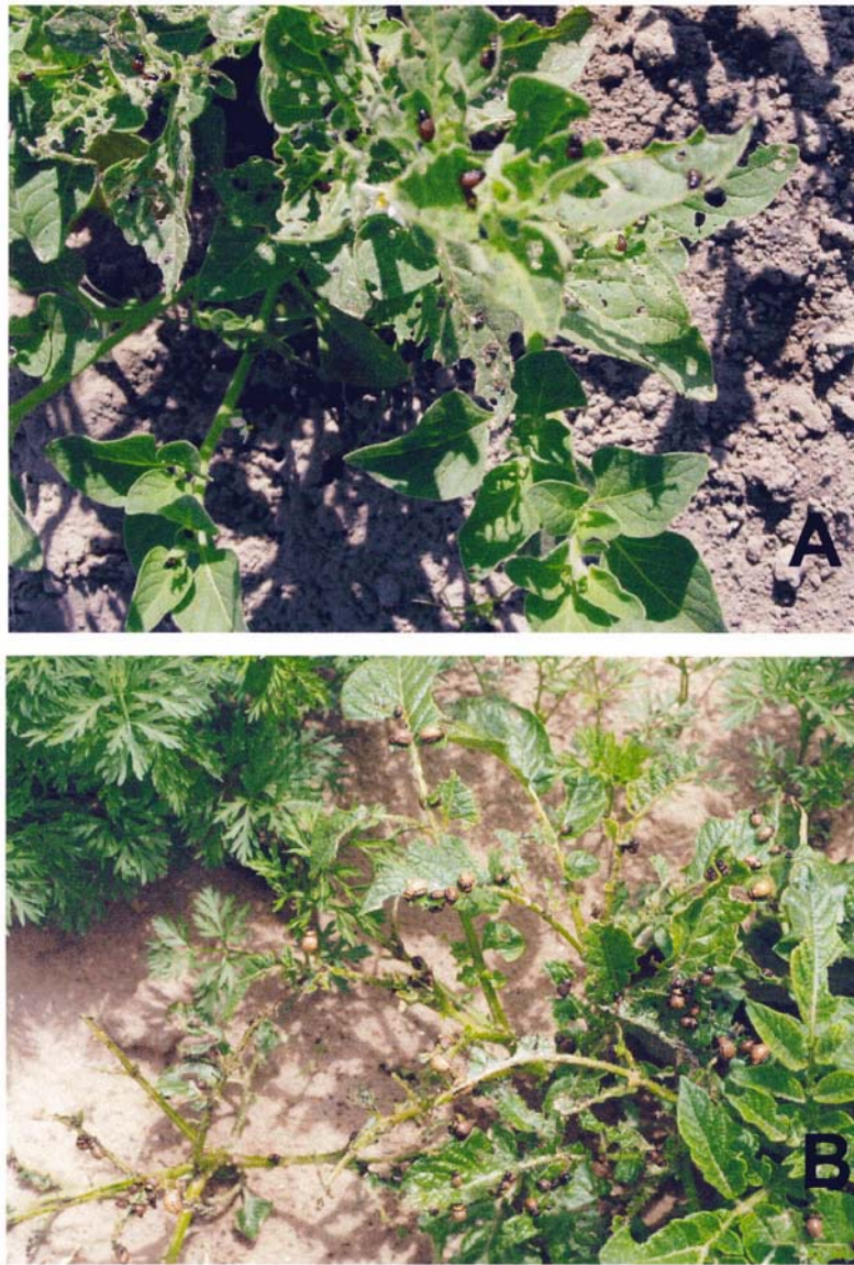
Figure 1. Colorado potato beetle larvae feeding on hairy nightshade in onions (A) and on volunteer potato in carrots (B) during midseason in southeastern Washington State.

Plants were harvested 14 days after herbicide application. Plants were clipped at the soil surface, and the stems and leaves (shoot biomass) were oven-dried at 70°C for 48 hours and weighed.