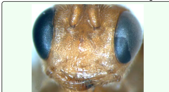
Figure 2. Laxiareola ochracea , Face. High quality figures are available online.

approximately 0.65 times as long as forewing. Scape almost cylindrical, approximately 2.3 times as long as its widest diameter; apical truncation nearly transverse; with 24 flagellomeres, ratio of length from flagellomere 1 to 5 in proper order: 4.0:3.8:3.6:3.4:3.2. Occipital carina complete, middorsal portion approximately horizontal.