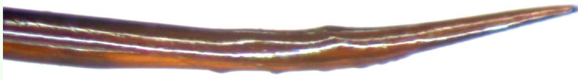
Figure 5. Laxiareola ochracea , Ovipositor. High quality figures are available online.

Area externa with distinct punctures. Residual portion with indistinct fine punctures. Propodeal spiracle oval, slightly raised.