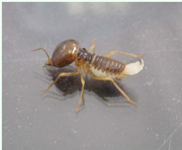
Figure 2. Larval parasitoid emergence posture in a parasitized soldier. High quality figures are available online.

days to develop to the adult stage under laboratory conditions. The fly was identified as V. fasciventris by Dr. H. Kurahashi (International Department of Dipterology, Tokyo, Japan).