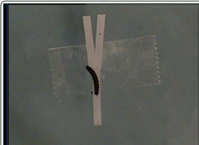
Video 1. Y constructed from sections of a paper strip over which caterpillars of Dione juno huascuma had previously walked (stem and right arm). A strip not previously walked on by caterpillars (blank) forms the left arm. The response of a caterpillar allowed to choose between the arms is shown. Click image to view video. Download video

each trial to preclude a positional bias. Maze sections and experimental caterpillars were used only once.