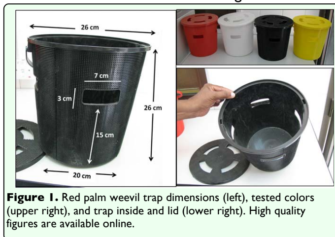
Figure 1. Red palm weevil trap dimensions (left), tested colors (upper right), and trap inside and lid (lower right). High quality figures are available online.

In the current study, the trap color was the color of the plastic material itself (original color), whereas in Al-Saoud et al. (2010), the traps were white and experimentally sprayed with different paints (painted color). A total of 48 traps were installed in four locations in the field. Each location was a date palm plantation in which four trap colors (white, yellow, red, and black) were tested. Each trap color was represented by three traps (replications) per location. Trap surface color values ( L^*a^*b ) were measured by a chromameter (Table 1). The L -value is the