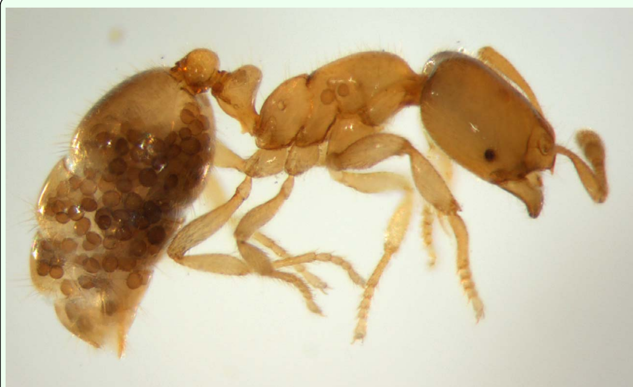
Figure 2. Mass of M. durum spores are visible in the gaster and the mesosoma of Solenopsis fugax worker collected in Czech Republic, near Mikulov at the end of August, 2010. High quality figures are available online.