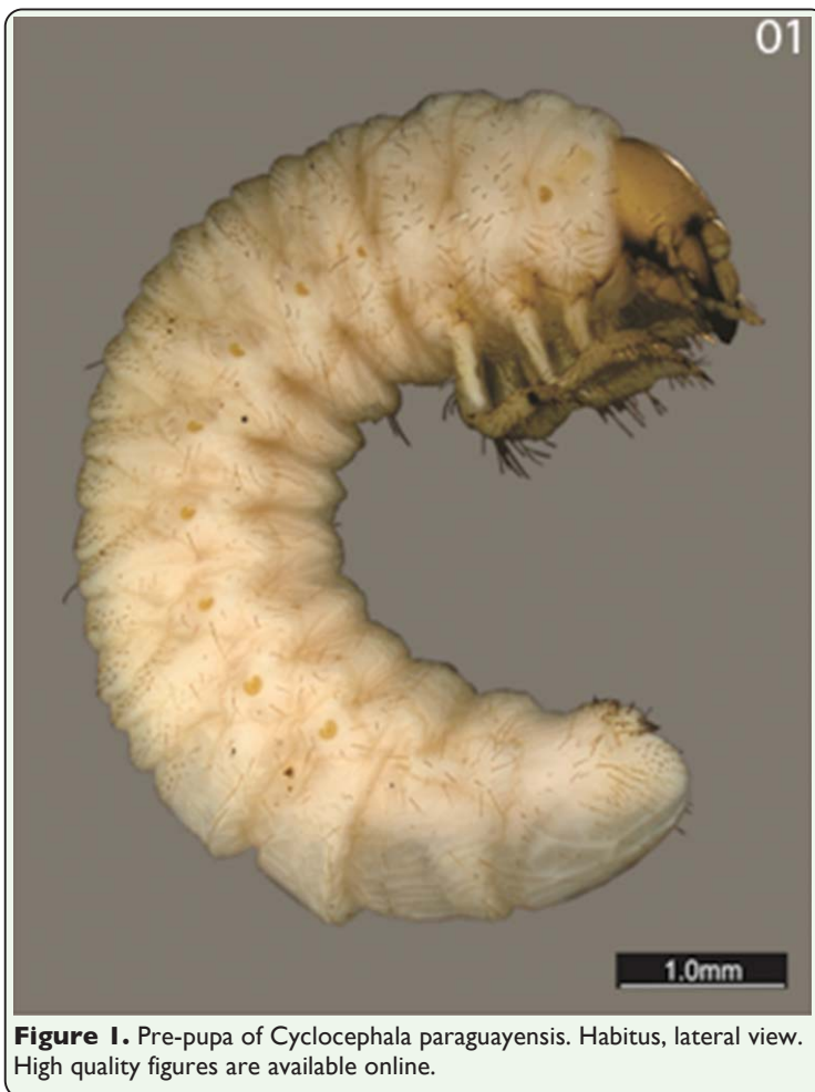
Figure 1. Pre-pupa of Cyclocephala paraguayensis . Habitus, lateral view. High quality figures are available online.

Despite numerous records of different species of Cyclocephala as crop pests (Cherry 1985; Pardo-Locarno et al. 2005; Blanco and Hernández 2006; Santos and Ávila 2007; Villegas et al 2008; García et al. 2009), our observations suggest that such is not the case for C. paraguayensis . The fact that captive-reared larvae thrived and developed into well-formed, fertile adults on an entirely saprophagous diet might indicate that they are not rhizophagous in the wild. However, Neita-Moreno and Morón (2008) have reported that the larvae of Ancognatha ustulata Burmeister (Dynastinae: Cyclocephalini) may adopt an herbivorous diet when deprived of suitable dead plant matter. Further investigation about the feeding behavior of immature Cyclocephalini should yield more solid results.