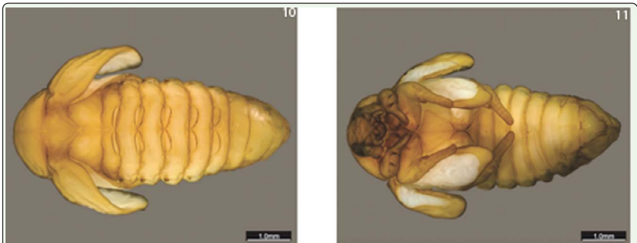
Figures 10–11. Pupae of Cyclocephala paraguayensis . 10- Habitus, dorsal view. 11- Habitus, ventral view. High quality figures are available online.

inent scleroma, left side more developed. Right side with 22 short setae. More than 30 straight, slender setae caudolaterad of the bases of the 2-jointed labial palpi. The bare median portion of the glossa is surrounded by 30 stout setae. Antennae. 4-segmented. Distal portion of segment 3 prolonged, with sensory spot. Segment 4 piriform, with 4 sensory spots (2 dorsal, 2 ventral), bearing few setae distally.