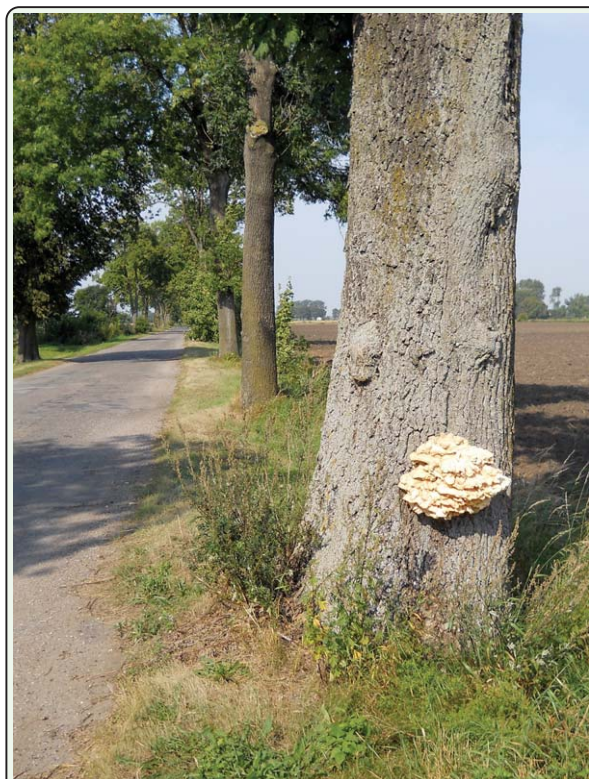
Figure 1. Sulphur polypore Laetiporus sulphureus growing on roadside tree in a rural avenue. High quality figures are available online.

For this study, samples of D. boleti were collected from fruiting bodies of L. sulphureus growing on roadside trees in rural avenues (Fig. 1) in northern Poland in the area between