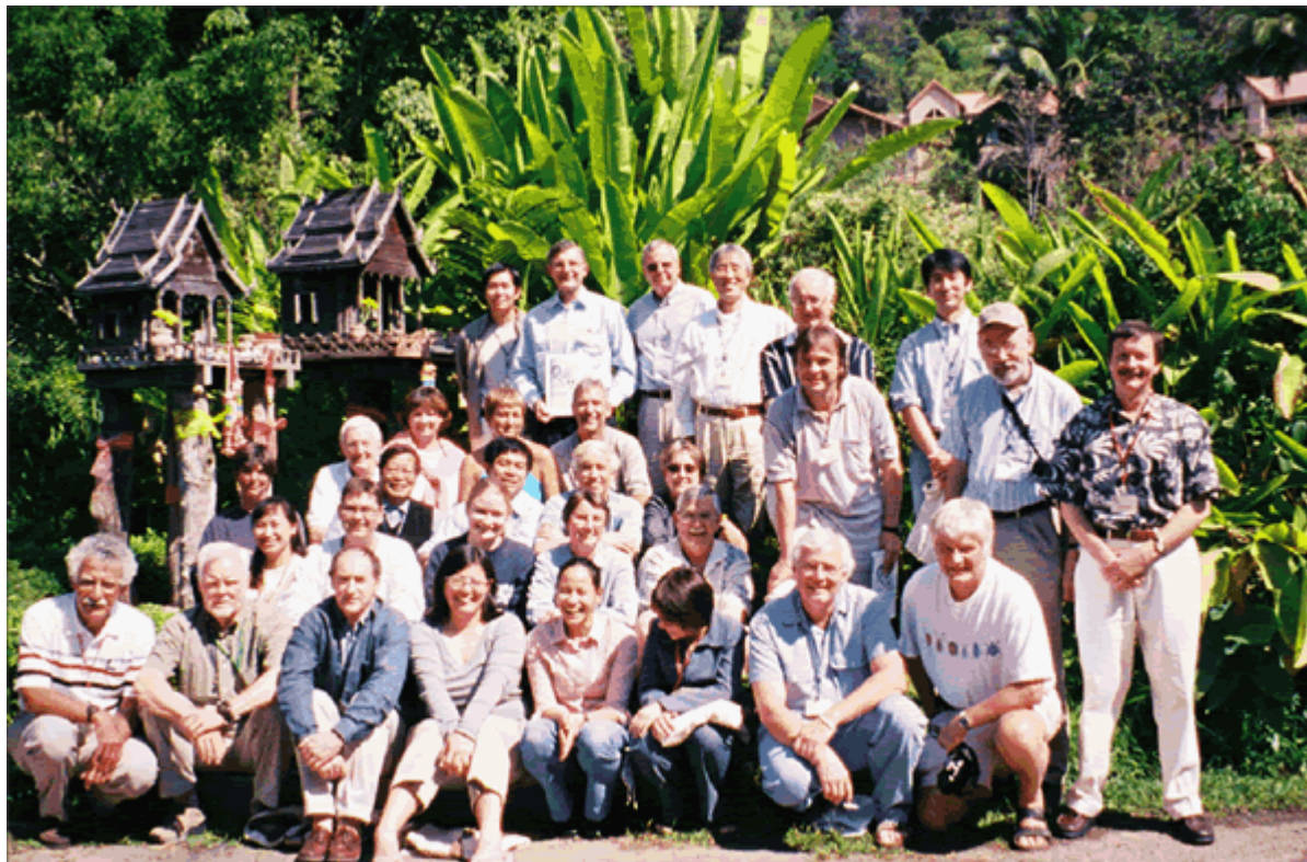
Image 1. Participants at the Invertebrate Neuropeptide Conference

Abstracts are listed in alphabetical order by the last name of the senior author.