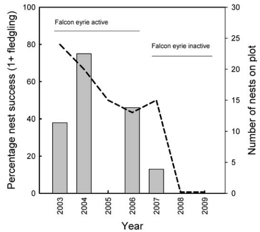
Figure 3. Percentage of monitored Pelagic Cormorant pairs that raised at least one chick to fledging age in each year from 2003 to 2009 at Triangle Island (vertical bars, left axis). Sample size is indicated by the number of nests built on the monitoring plot (dashed line, right axis). No nests were built—thus no offspring were produced—in the last two years when the Peregrine Falcon eyrie was inactive. Note that the eyrie was inactive in 2007 but a single falcon remained in the vicinity of the colony throughout most of the summer.

breeding success at Triangle Island was above average for murres (Hipfner and Greenwood 2008) and close to average for cormorants (Hipfner and Greenwood 2009) while the eyrie was active. But murres and cormorants both failed completely in two of the three years when the eyrie was inactive, and only in these years did we see Bald Eagles kill adult murres and facilitate the taking of murre eggs by Glaucous-winged Gulls after incubating murres flushed. That the breeding success of murres and cormorants was intermediate in the year when a single falcon remained in the vicinity of the inactive eyrie further suggests that falcon presence and successful breeding by seabirds were causally linked. While other studies report year-to-year variation in the benefits of nesting associations (Smith et al. 2007), rarely are the population-level effects so dramatic (Haemig 2001). Finally, the nesting association is noteworthy for its local conservation implications, in that it involved virtually the entire breeding population of Common Murres in British Columbia (Hipfner 2005).