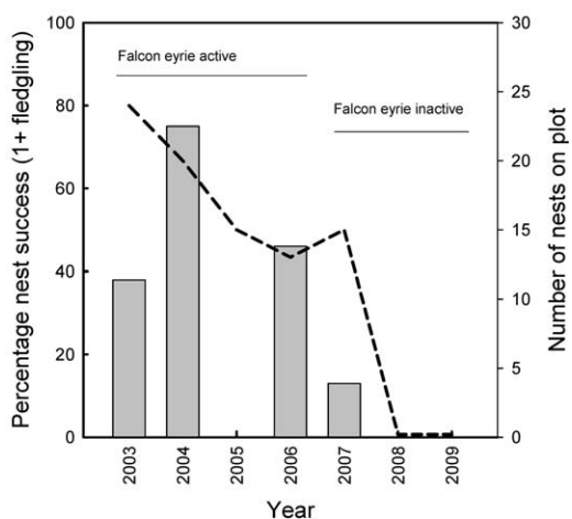
Figure 3. Percentage of monitored Pelagic Cormorant pairs that raised at least one chick to fledging age in each year from 2003 to 2009 at Triangle Island (vertical bars, left axis). Sample size is indicated by the number of nests built on the monitoring plot (dashed line, right axis). No nests were built—thus no offspring were produced—in the last two years when the Peregrine Falcon eyrie was inactive. Note that the eyrie was inactive in 2007 but a single falcon remained in the vicinity of the colony throughout most of the summer.

breeding success at Triangle Island was above average for murres (Hipfner and Greenwood 2008) and close to average for cormorants (Hipfner and Greenwood 2009) while the eyrie was active. But murres and cormorants both failed completely in two of the three years when the eyrie was inactive, and only in these years did we see Bald Eagles kill adult murres and facilitate the taking of murre eggs by Glaucous-winged Gulls after incubating murres flushed. That the breeding success of murres and cormorants was intermediate in the year when a single falcon remained in the vicinity of the inactive eyrie further suggests that falcon presence and successful breeding by seabirds were causally linked. While other studies report year-to-year variation in the benefits of nesting associations (Smith et al. 2007), rarely are the population-level effects so dramatic (Haemig 2001). Finally, the nesting association is noteworthy for its local conservation implications, in that it involved virtually the entire breeding population of Common Murres in British Columbia (Hipfner 2005).