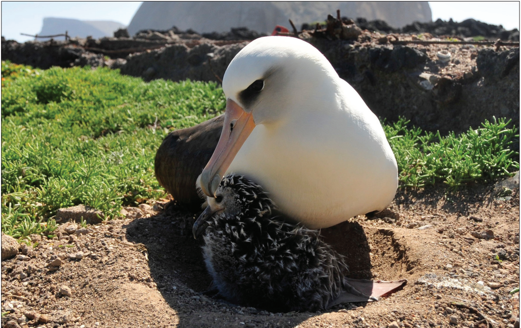
Frontispiece. The islands and archipelagos of northwestern Mexico are critically important for the conservation of many seabird species, such as: Top Left – Yellow-footed Gull ( Larus livens ), which breeds only in the Gulf of California; Top Right – Black-vented Shearwater ( Puffinus opisthomelas ), of which 95% of the global population breeds on Natividad Island; Bottom – Laysan Albatross ( Phoebastria immutabilis ) pictured here on Guadalupe Island, but it also nests farther south in the species only subtropical breeding colony in the world on the Revillagigedo Archipelago.