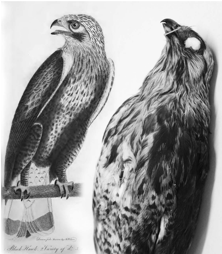
Figure 3. (left) Alexander Wilson's published image of the "Variety of [Black Hawk]" in American Ornithology (1812, Pl. 53). (right) Digital photograph of ANSP 1563, which served as the model for Wilson's drawing and was deposited by him in the Peale Museum in January 1812 (Peale Museum No. 405).

"no numbers ... on the specimens to fix their identity" (ANSP Archives, coll. 54, box. 4). Ten years later, by which time the modern ANSP numbering system had been implemented, Stone (1899) published a catalog of type specimens in the ANSP collection, in which he explained: "The collections [of the Peale Museum] were dispersed at auction upon the breaking up of the museum and such Wilson specimens as may have been there are probably lost. Two of the types [i.e., Broad-winged Hawk and Mississippi Kite] were, however, obtained in exchange by the Academy before the Peale collection was scattered" (Stone 1899:11). Stone (1915:512) later wrote that, along with the 2 specimens at ANSP and a third at Vassar College (see below), "[the MCZ specimens without data] probably comprise all that are extant