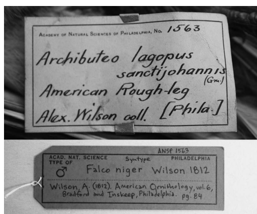
Figure 5. Two labels attached to ANSP 1563: (upper) a historical label created around the time the specimen was given its ANSP number; (lower) a modern type label written by the author in January 2019.

The bill of the bird in Wilson's Pl. 53 (1812) is open, but the bill of the specimen was later forced closed with a metal clamp, probably when it was dismantled in the late 19th century (see Fig. 3). A paper label attached to the specimen reads: "Academy of Natural Sciences of Philadelphia No. 1563 / Archibuteo lagopus sanctijohannis (Gm.) / American Rough-leg / Alex. Wilson coll. [Phila]." (Fig. 5). This information is corroborated by an entry in the ANSP specimen ledger: "Donor: Alex Wilson / Remarks: Wilson's orig. specimen" (ANSP Archives, coll. 54, box 1). However, this entry is easily overlooked because it is written in miniscule letters, with erratic penmanship, and a similar name ("Dr. Wilson," referring to ANSP trustee Dr. Thomas B. Wilson) appears 6 times on the same ledger page.