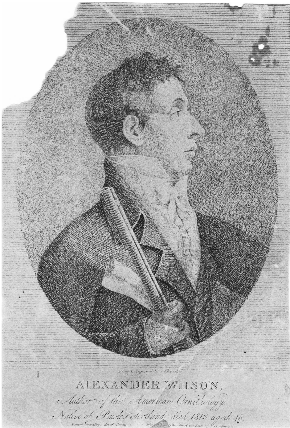
Figure 1. Portrait of “Alexander Wilson, author of the American Ornithology, Native of Paisley Scotland, died 1813 aged 45,” drawn and engraved by John James Barralet (1747–1815) within 2 years of the ornithologist’s death.