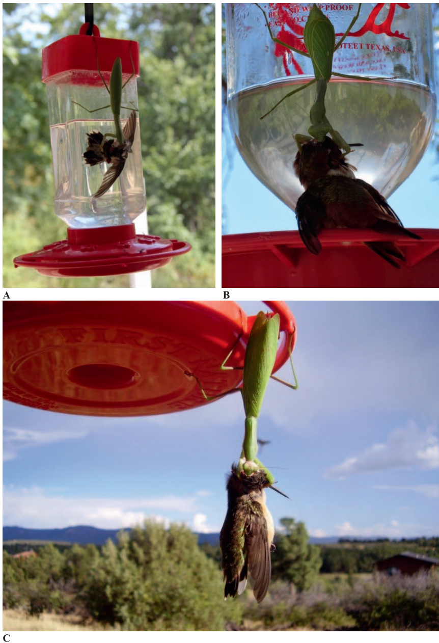
FIG. 1. Predation of birds by mantids at hummingbird feeder locations in the USA. (A) Tenodera sinensis eating a Ruby-throated Hummingbird ( Archilochus colubris) in Green Castle, Missouri ; (B) Stagmomantis limbata eating Allen's Hummingbird ( Selasphorus sasin) in San Juan Capistrano, California ; and (C) Mantis religiosa eating a Black-chinned Hummingbird ( Archilochus alexandri) in Millwood, Colorado.

The preponderance of predation events of hummingbirds in North America can be explained by several factors. First, North America is inhabited by some of the world's smallest birds,