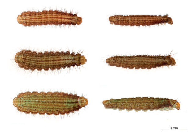
FIG. 2. Dorsal (left) and lateral (right) views of early instar Adelotypa annulifera.