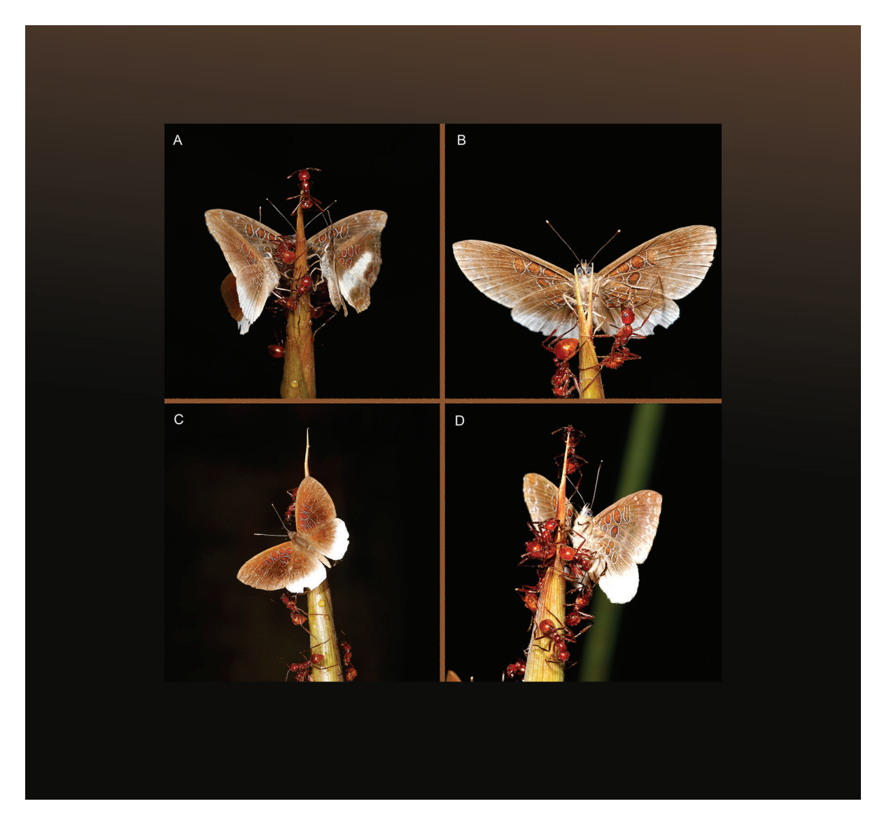
FIG. 5. Adult Adelotypa annulifera putative wing pattern mimicry. ( A ) Male (left) and female (right) butterflies perched on bamboo shoot in presence of Megalomyrmex balzani ants. View of A. annulifera wing pattern: ( B ) Ventral ( C ) Dorsal ( D ) Lateral.

of time, not unlike when the ants antennate the caterpillars in return for a nectar reward (Fig. 4C), however, extensive observations revealed that the butterflies did not provide any apparent resource for the ants. Thievery of a food source (kelptoparasitism) occurs in many arthropod groups (Eisner et al. 1991; Sivinsky et al. 1999) and in this case, A. annulifera adult butterflies appear to display a kelptoparasitic behavior towards attendant ants by taking a nutritive resource, in this case bamboo sap secretions (Fig. 4D–F).