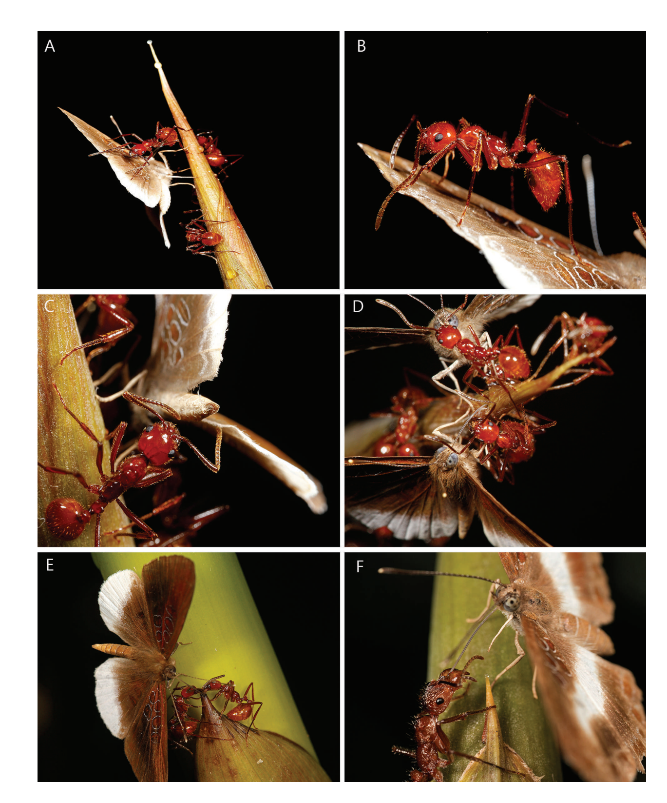
FIG. 4. Adult Adelotypa annulifera interactions with ants on bamboo. ( A ) Antennation of adult butterfly wings. ( B ) Ant crawling on butterfly wing. (C) Antennation of butterfly abdomen. ( D-E ) Butterflies and ants utilizing extrafloral nectary source on bamboo. ( F ) Butterfly drinking bamboo fluid directly from Ectatomma ant mandibles.