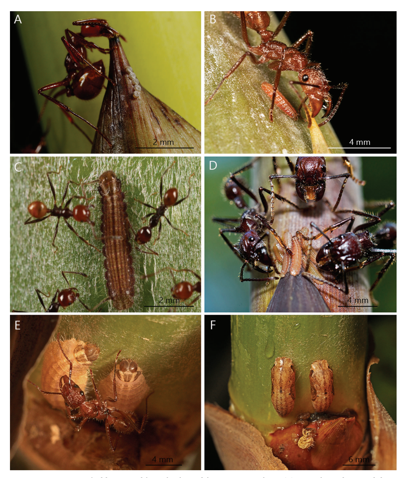
FIG. 1. Immature stages of Adelotypa annulifera on bamboo and their association with ants. (A) Eggs with Megalomyrmex balzani. (B) First instar larva with Ectatomma tuberculatum. (C) Mid-instar larva with Pheidole sp. (D) Mid-instar larvae with Paraponera clavata. (E) Final instar larvae with E. tuberculatum. (F) Pupae.